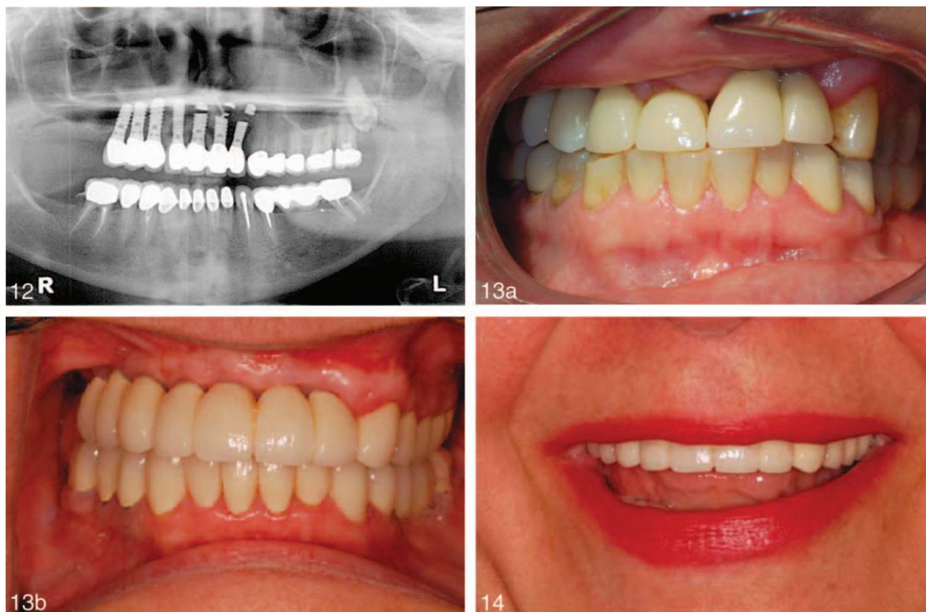
FIGURES 12–14. FIGURE 12. Complete dental rehabilitation. The dental implants restored with 2 sections of matching crowns. Given the week ratio crown/implant #10, the occlusion is adjusted on this implant, as if crown #10 was a cantilever. FIGURE 13. Frontal view; significant improvement of the implant-supported crown aesthetic profile. FIGURE 14. Smile view. The occlusal line harmony and the incisor elongation translate into a more harmonious smile.

sponge (ACS) was coated with the rh-BMP2. This ACS was placed between and over the bone blocks buccal surface, as well as the surface of all implants with a bone dehiscence. A Bioguide collagen membrane was coated with Platelet Rich Plasma (PRP), which was activated with autologous thrombin, and covered the rh-BMP2 membrane. PRP is used for its soft tissue healing properties, thus maintaining the incision closed and reducing the risk of postoperative reopening. 21 A physical barrier made of perforated titanium mesh was placed between the Bioguide collagen membrane and the ACS, the barrier was maintained in that position with retaining screws (Figure 10). The titanium mesh is used for space maintenance to allow bone growth. 22,23 The closing of the incision was completed with Teflon-based sutures. Temporization was done with a lab-made acrylic bridge from the second modified cast study.