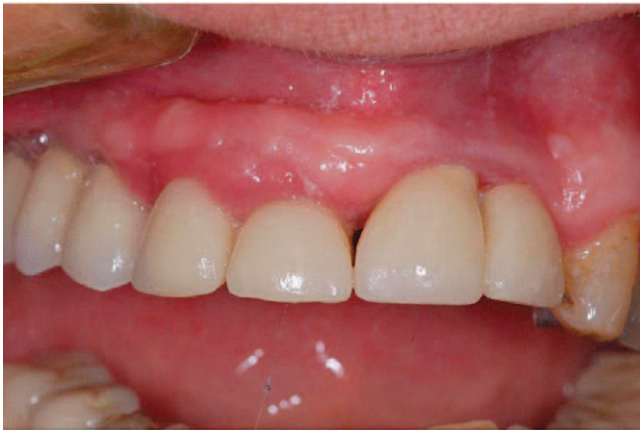
FIGURE 1. Patient's complaints: tooth #8 up into her palate causes speech impediment; poor aesthetics of teeth #9 and 10.

designed in a cantilever manner when viewed in an anterior-posterior cut. This implant presents a bone dehiscence on the vestibular surface (Figure 2). Implants #9 and 10 are almost in contact at the coronal one-third and are more apical compared with the other teeth. All these prosthodontic implant-supported restorations are out of occlusion. Only her 4 natural teeth support the complete occlusion of her maxilla.