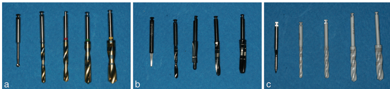
FIGURE 1. The implant drill systems. (a) The TiN-coated drill served as a control. The diameters for each drill sequence were 1.8, 2.0, 2.5, 3.2, and 4.2 mm (left to right). The color of the TiN coating was gold, as is typical. (b) The WC/C-coated drill had a black coating. The diameters were 1.5, 2.0, 3.0, 3.4, and 4.3 mm (left to right). Note that the third drill was not a twist drill but a pilot drill that enlarged a hole from 2.0 mm to 3.0 mm in diameter; the pilot drill was used as recommended by the manufacturer. (c) The zirconia ceramic drill was white in color. The diameters were 1.7, 2.0, 2.8, 3.5, and 4.2 mm (left to right).

zirconia ceramic drills and to compare heat production between drills.