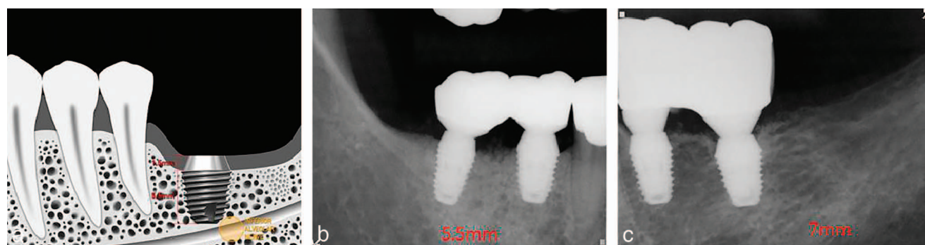
FIGURE 2. Two types of installation depths are available. (a) The height of the smooth surface collar is 1.5 mm. The length of the rough surface fixture is 5.5 mm. (b) For the 5.5-mm depth placement, the entire collar was exposed above the alveolar crest. (c) For the 7-mm full-length placement, the top of the collar coincided with the alveolar crest.

The subjects were divided into 2 groups according to the