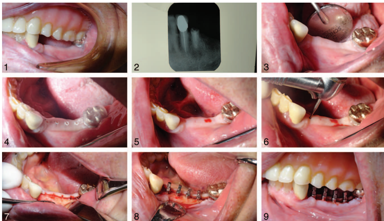
FIGURES 1–9. FIGURE 1. Initial intraoral-centric relation. FIGURE 2. Initial periapical radiographs. FIGURE 3. Initial intraoral-presurgical facial view. FIGURE 4. Surgical template. FIGURE 5. Bleeding points indicating future implant sites. FIGURE 6. Transgingival penetration with a #2 round surgical bur. FIGURE 7. Mucoperiosteal flap. FIGURE 8. (4) 2.1mm × 10mm collared square-head mini dental implants (MDI)-facial view. FIGURE 9. (4) 2.1mm × 10mm collared square-head MDI-centric relation.

reported nonspecific symptoms with #22 (mandibular left canine) but no definitive diagnosis was made. The presurgical site demonstrated a facial-lingual osseous width of 5 mm osseous ridge in areas #19 and 20, and a 3 mm zone of keratinized gingiva (Figure 3). Panoramic and periapical radiographs exhibited 13 mm of bone height, measured from the alveolar crest to the superior border of the radiographic mandibular canal.