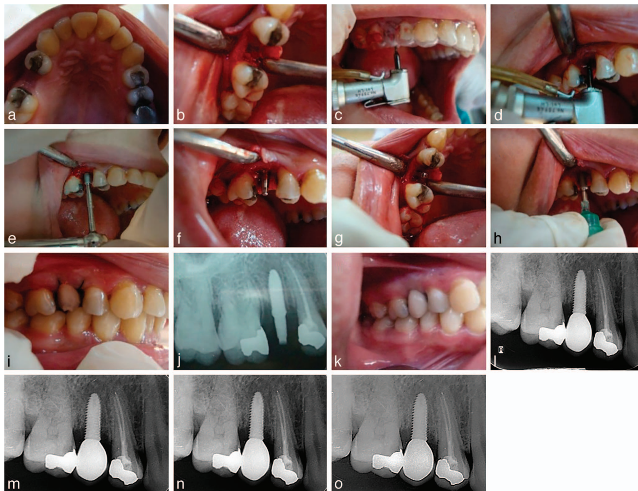
FIGURE 2. Series of photographs for one-piece implant placement without local melatonin application and follow-up of digital standard periapical radiographs. (a) and (b) A perioperative photograph and flap reflection. (c–h) Photographs show the steps of implant placement. (i) and (j) Photograph and a radiograph show the implant in place after initial placement. (k) A photograph shows final prosthetic restoration in place and in occlusion, 2 weeks after initial implant placement. (l–o) Periapical radiographs show levels of marginal bone loss around the implant after 3, 6, and 12 months, respectively.

At 1 month of follow-up, the PTM in group I in the present study were significantly more than the PTM in group II. It is well known that the implant stability is directly related to the percentage of the bone to implant contact area. 17 Cutando et al 5 showed that after a 2-week treatment period, melatonin significantly increased the perimeter of bone that was in direct contact with the treated implants, bone density, new bone formation, and interthread bone.