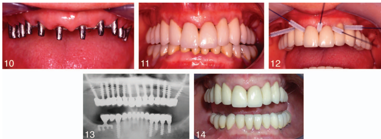
FIGURES 10–14. FIGURE 10. Correct positioning of the supporting bar and abutments before cementation of the definitive prosthesis. FIGURE 11. Full-arch, gold-ceramic maxillary prosthesis after insertion. FIGURE 12. Oral hygiene procedures are demonstrated to the patient. FIGURE 13. Thirteen-year follow-up radiograph shows preservation of bone surrounding all of the implants. FIGURE 14. Thirteen-year follow-up intraoral photograph shows healthy appearance of the oral mucosa.

also be used with implant abutments and submerged implants. Among the advantages of intraoral welding are immediate stabilization of the implants, immediate provisionalization, reduced risk of failure during the healing period, elimination of errors caused by unsatisfactory impression-making, and a potential reduction in patient complaints and discomfort.