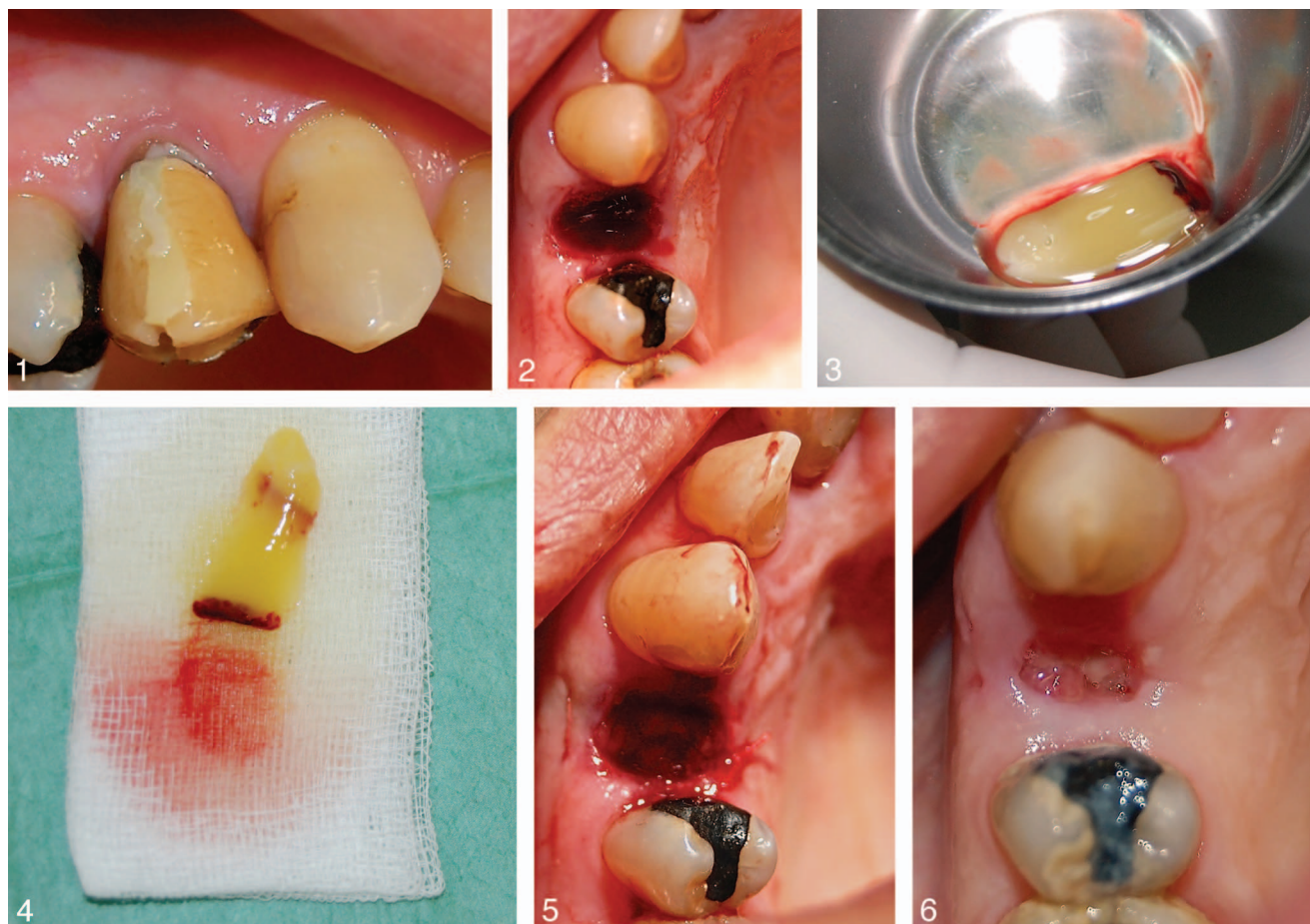
FIGURES 1–6. FIGURE 1. Baseline clinical view of the hopeless maxillary first premolar. FIGURE 2. Intraoperative view following tooth extraction. Note the maintenance of gingival contours owing to the atraumatic extraction technique. FIGURE 3. Platelet rich fibrin (PRF) clot immediately following extraction from the centrifuged blood sample vial. FIGURE 4. Fibrin membrane formed following manipulation of the PRF clot. FIGURE 5. Clinical view at the end of the surgical procedure. FIGURE 6. Clinical view at 2 weeks postoperatively showing complete epithelization.

postextraction sockets while minimizing the duration of the treatment.