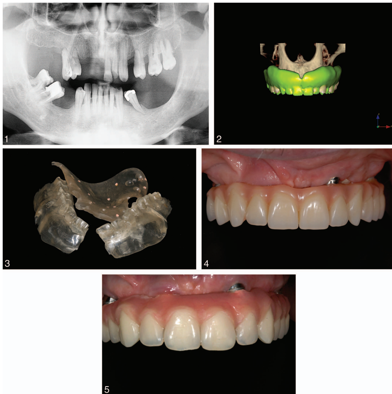
FIGURES 1–5. FIGURE 1. Pretreatment panoramic radiograph. FIGURE 2. Tridimensional software showing the virtual planning. FIGURE 3. Base and teeth setup portions of the disassembled maxillary radiographic guide. FIGURE 4. Temporary restoration screwed to the implants at abutment level. FIGURE 5. Screw-retained complete-arch restoration.

indications; pregnancy or nursing; any interfering medication (steroid or bisphosphonate therapy); alcohol or drug abuse; heavy smoking (>10 cigarettes/day); radiation therapy to head or neck region within 5 years; parafunctional activity; untreated periodontitis; poor oral hygiene and motivation defined as a full-mouth bleeding on probing and full-mouth plaque index \geq 25\% ; subject has known allergic or adverse reactions to the restorative material; and unavailability for regular follow-ups.