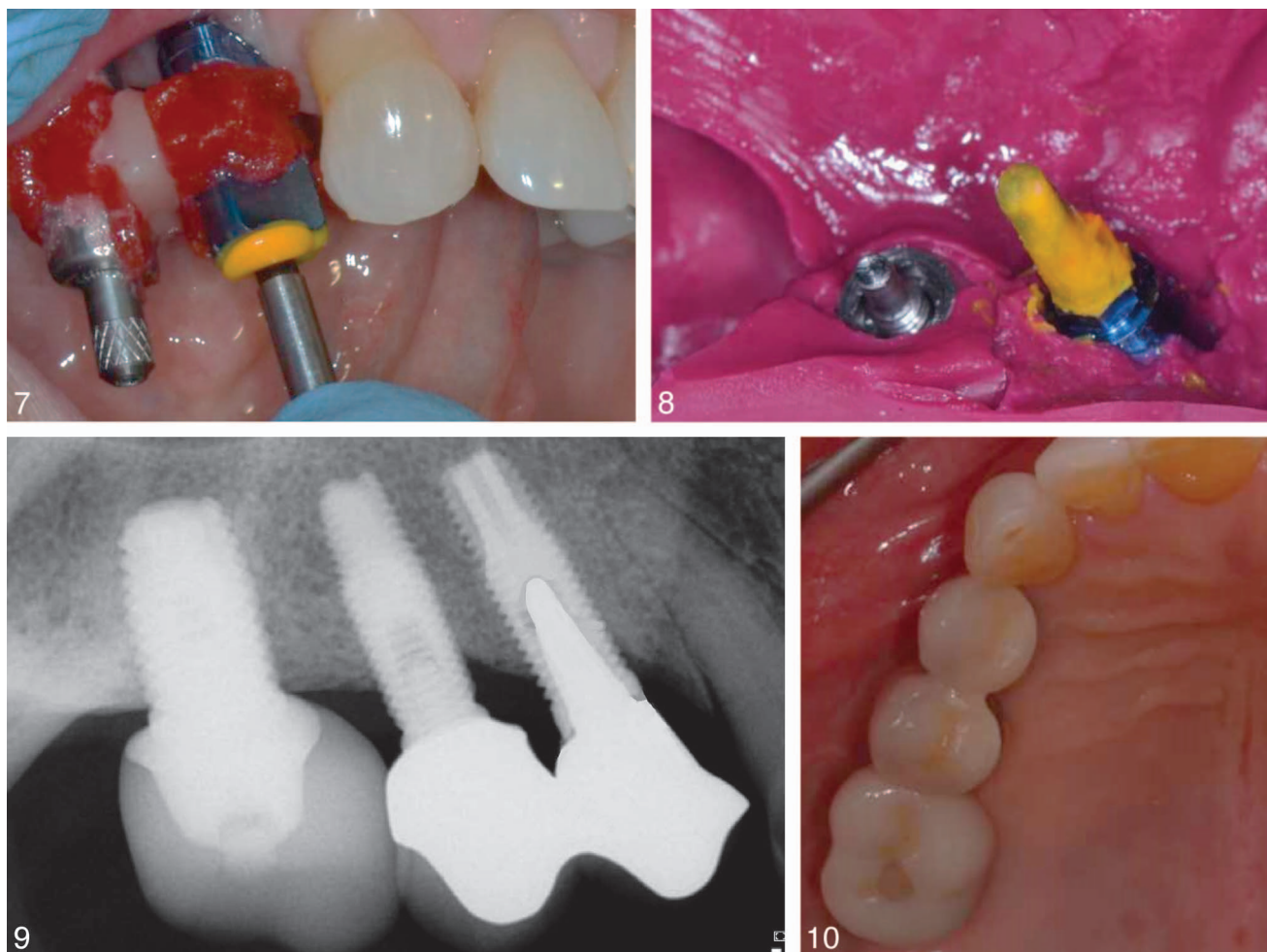
FIGURES 7–10. FIGURE 7. Clinical view showing low-viscosity polyvinyl siloxane material inside impression coping. FIGURE 8. Completed impression. FIGURE 9. Periapical radiograph of completed prosthesis. FIGURE 10. Clinical view of completed prosthesis on right.

An open-tray impression was then made with a medium-viscosity PVS material (Figure 8).