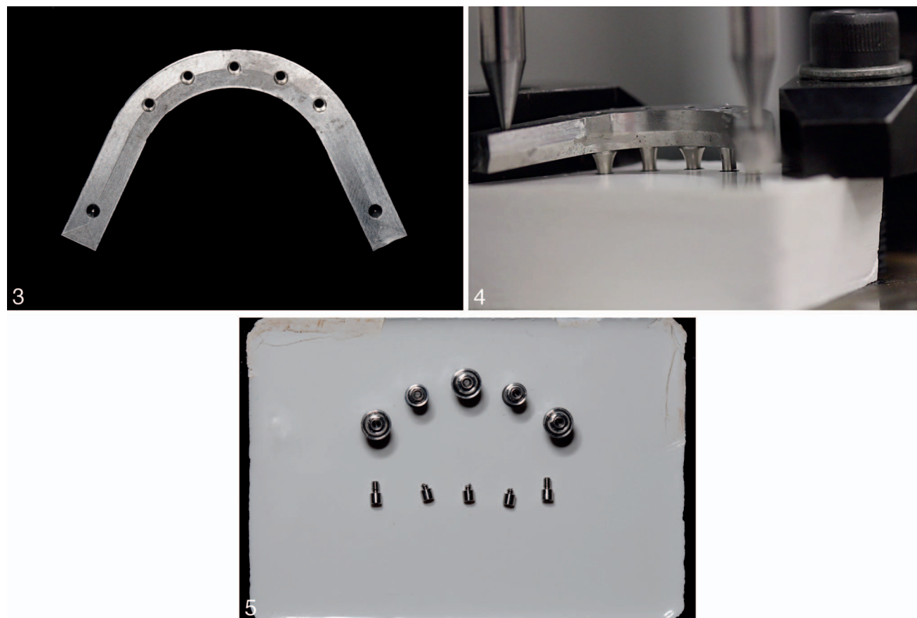
FIGURE 3–5. FIGURE 3. Milled framework used for fracture strength testing. FIGURE 4. Fracture strength testing. FIGURE 5. Fractured prosthetic screws after fracture strength testing showing intact screws number 1 and 5.