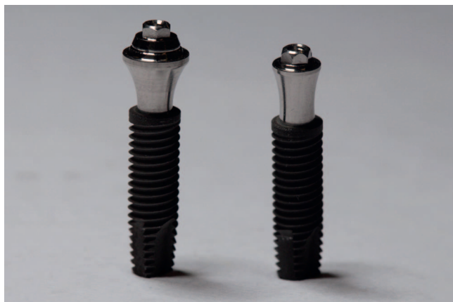
FIGURE 1. Prosthetic abutments tested in the study (left, standard diameter; and right, small diameter).

tation with a full-arch fixed dental prosthesis (FAFDP). Prosthetic abutments with different dimensions (4.8-mm diameter miniconical abutment and 3.5-mm diameter microconical abutment, Neodent) (Figure 1) were screwed to the implants using a 32 Ncm torque. Both prosthetic abutments had 4.5 mm in height. The following groups were divided ( n = 3 ): G1 with 5 miniconical abutments (standard sized abutment),