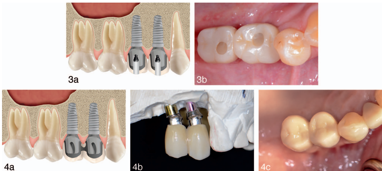
FIGURES 3 AND 4. FIGURE 3. (a) Class III prosthetic design. Individual crowns are fabricated that are cement and screw retained. (b) Clinical situation where 2 adjacent implants were restored with 2 individual cement- and screw-retained crowns. FIGURE 4. (a) Class IV prosthetic design. The crowns are splinted together and cemented on the abutments. (b) Prosthetic design where 2 splinted crowns were fabricated to be cemented on the abutments. (c) Clinical situation; intraoral view with the definitive Type IV prosthesis cemented on the abutments.