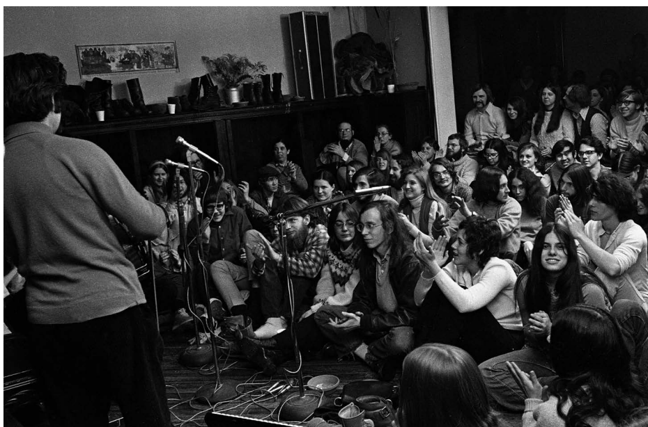
FIGURE 1. Audience at performance of the High Level Ranters, The Ark in Ann Arbor, January 29, 1971