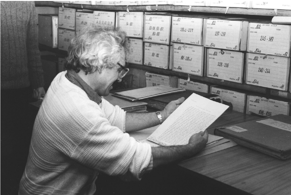
FIGURE 3. The author in the stacks of the State Archives of the Russian Federation in Moscow in 1995, holding the original abdication of the last Romanov emperor, Mikhail Aleksandrovich, younger brother of Nicholas II.