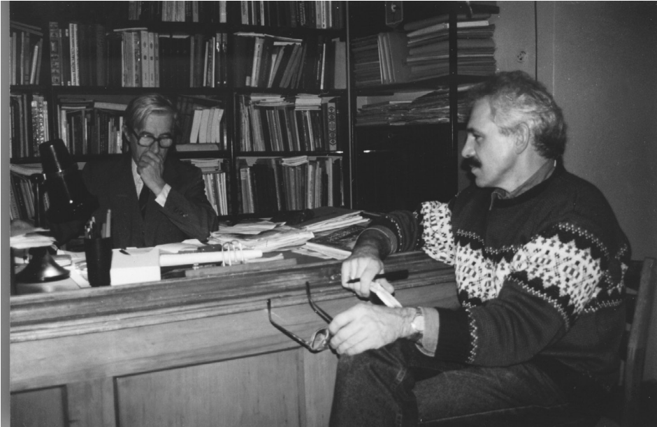
FIGURE 1. The author speaking with the late O. J. Matsiuk, director of the State Historical Archives in Lviv, Ukraine, November 1993.

was attached to the All-Union Council of Ministers; it also managed subordinate republic-level GAUs. Statutory ensconcing of archives established the archival system throughout governmental, social, and other corporate entities in Soviet life at all levels (all-union, republic, oblast [province], city, raion [county], state farm, industrial enterprise, etc.). An operational and methodological unity, based on fat regulatory codices, facilitated records management and archival administration throughout the Soviet Union.