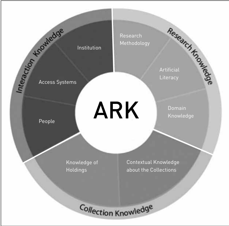
FIGURE 1. Archival Reference Knowledge.

Based on our analysis of the data from the interviews and the survey, we propose a new model of Archival Reference Knowledge, which is presented in Figure 1.