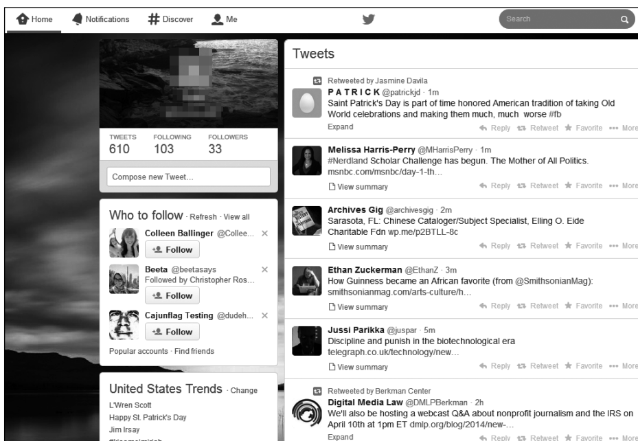
FIGURE 2. Twitter’s interface has been refined based on the ways users tweet.

created additional ways to use the functions. 12 Figure 2 displays some of Twitter’s current functionality.