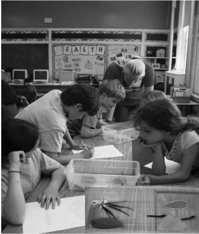
Figure 1. Third graders observing their caterpillars with four plant options (inset).

and 10 of the 16 larvae ultimately ate a leaf, with 100% of the feeding occurring on pipevine. The students were enthusiastic about observing their caterpillars, and surprised to find that although the caterpillars came into contact with all of the leaves, they ate only one kind of leaf. Students also noted that during the observation period the caterpillars were pooping, “kissing,” resting, and “fighting.”