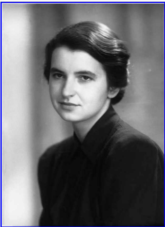
Figure 3. Rosalind Elsie Franklin.

Sometimes, peer-reviewed articles never get published because of the jealousy or the politics of the reviewers or because the article's conclusions threaten an orthodoxy. An example of the latter in biology is that of Lynn Margulis, who presented evidence that mitochondria were former free-living bacteria that developed a symbiotic relationship with another single-celled organism. Her paper on the theory of endosymbiosis was rejected by 15 different journals, and finally accepted by The Journal of Theoretical Biology in 1967 (Lane, 2006). Endosymbiosis is now considered a central tenet of biology. The lesson