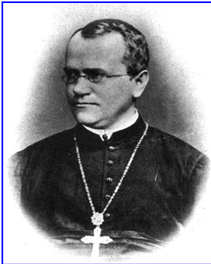
Figure 2. Gregor Mendel (1822–1884).

In a postscript to his paper, Correns seems to take de Vries to task by adding the following, referring to another paper that de Vries published shortly later ( italics original to Correns ):