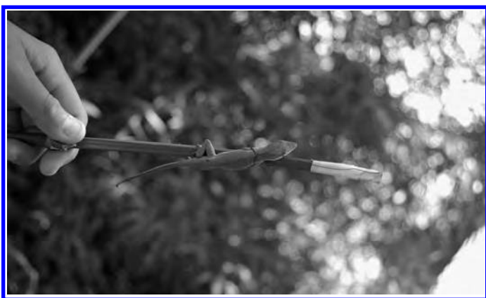
Figure 1. A Carolina green anole, Anolis carolinensis , captured with a lizard lasso.

Why Lizards, and Why Now? The growth of human communities and our effects on natural habitats are having its toll on our lizards, as for so many other taxonomic groups. Habitat loss and fragmentation is the main threat to lizards, but other factors are being raised as issues as well: overexploitation, predation, and climate variation. The purpose of the ...Year of the Lizard ... is to raise awareness for lizard conservation. With place-based management, local populations can thrive. This is a taxonomic group that can benefit by Citizen Science actions.... We believe that citizens, natural resource managers, scientists, and the pet and food and related industries can work together to address issues and to help ensure long-term survival of lizard species and populations. ( http://www.parcplace.org )