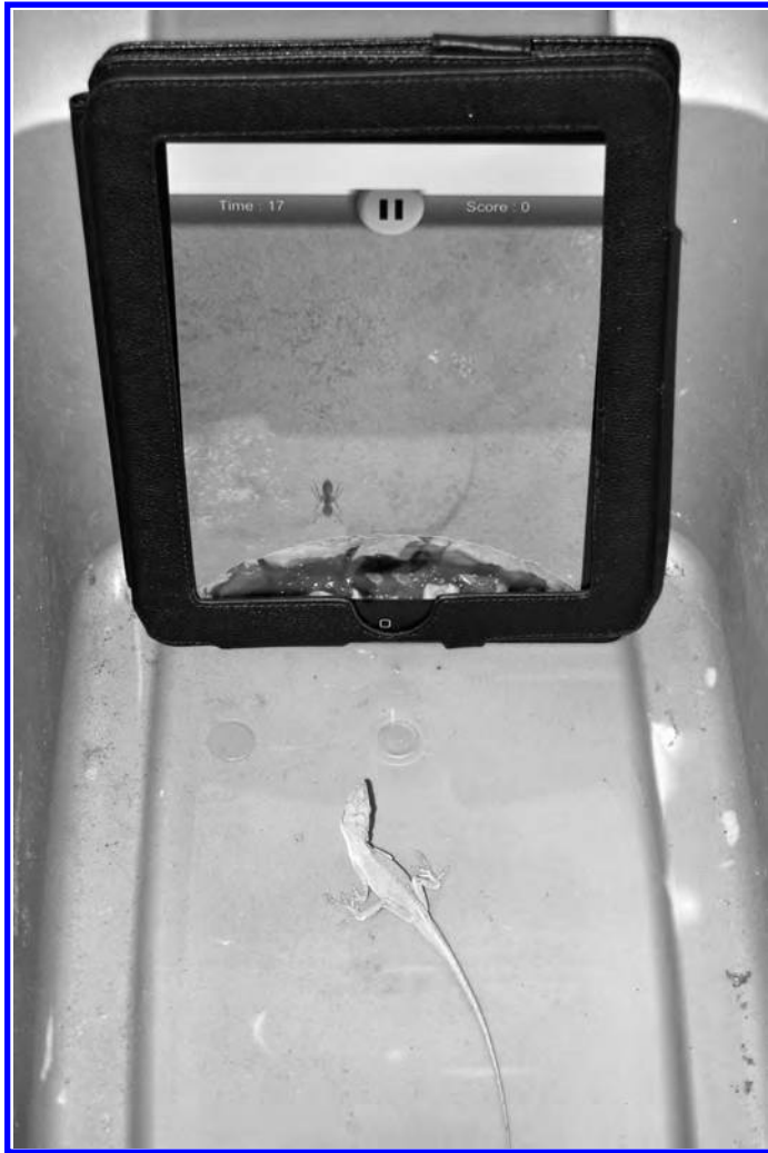
Figure 6. Testing anoles, Anolis carolinensis , on the Ant Crusher game.