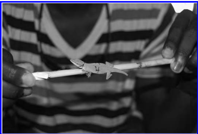
Figure 5. Marked female anole, Anolis carolinensis , with regenerating tail.