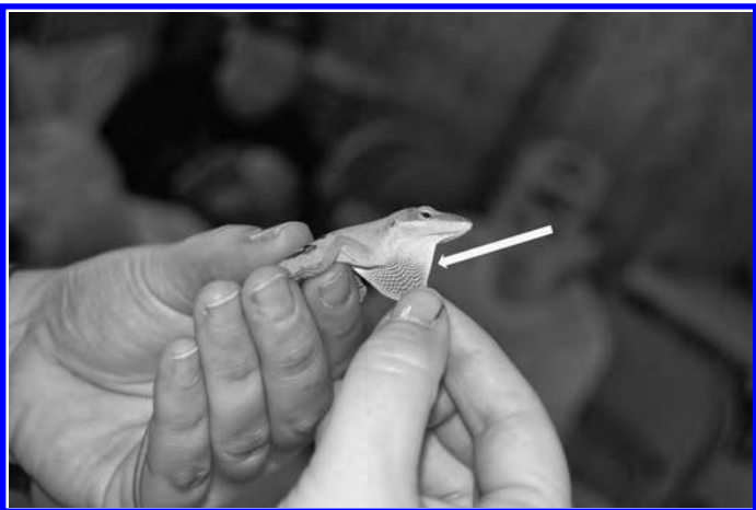
Figure 4. Male anole, Anolis carolinensis , found at Rockfish. Student shows the large, red dewlap (marked with arrow) that distinguishes male anoles from female anoles.