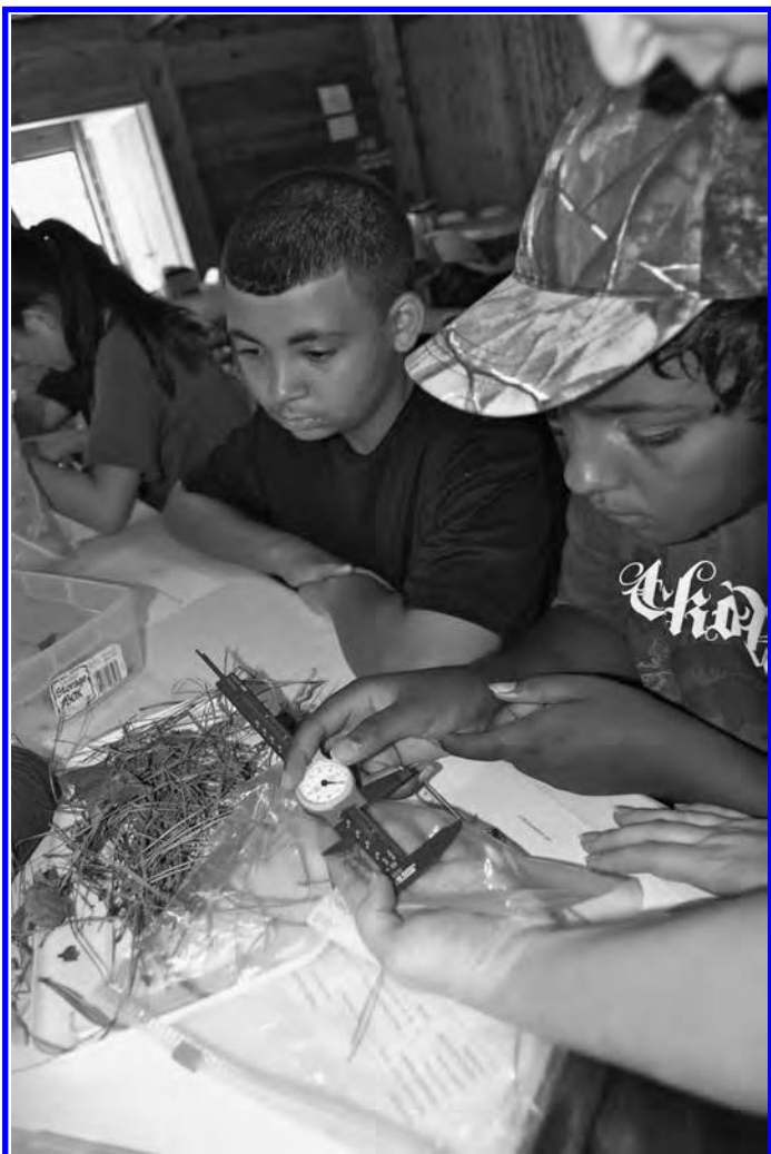
Figure 3. Student measuring a lizard at Rockfish.