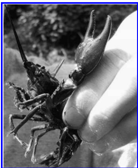
Figure 1. Students are given a demonstration on proper handling of crayfish. Crayfish should be picked up directly behind the thorax to prevent pinching.

a Quantity will be sufficient for entire class.