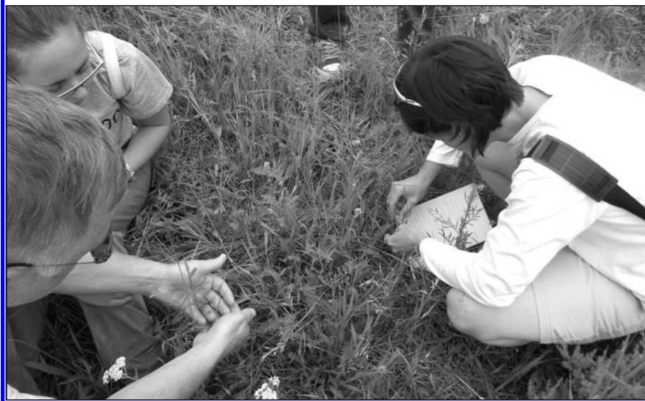
Scientists at Michigan State University collecting data on invasive and native plant species, such as the number of insects found on each plant and the percent of leaves damaged by insect herbivores.

invaders are successful. To test this idea, a lab at Michigan State University collected data on invasive and native plant species in Kalamazoo County. They measured how many insects were found on each species of plant, as well as the percent of leaves that had been damaged by insect herbivores. The data they collected is found below and can be used to test whether invasive plants are successful because they get less damage from insects compared to native plants.