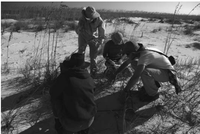
Figure 1. A team of volunteers surveys a long-term vegetation census plot on St. George Island, Florida.

Although this may not be obvious to your workers, the data recorder is one of the most important roles. This person must be