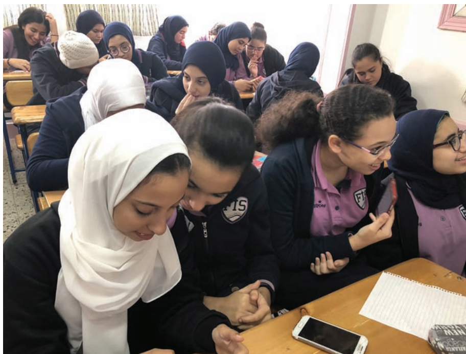
Figure 2. Launch day for the activity in Cairo, Egypt.

Before constructing an analogy, students were asked to share information about their homes. They tended to see more similarities than differences between Cairo and Phoenix homes. Common