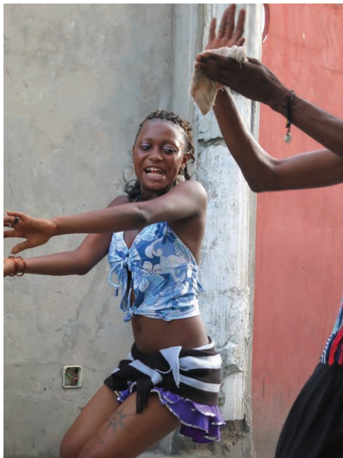
6 Danseuse learning new dance sequence from the band choreographer.

The three main genres of music in Kinshasa are “modern,” “traditional,” and “religious” (White 2008:31). To be sure, like dance, there is aesthetic mixing in the music itself (religious music in form is virtually identical to profane music). However, what moves music into one category or another is the lyrics.