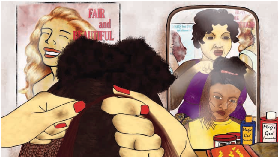
3 A still image from the opening sequence to Ng'endo Mukii's Yellow Fever (2012) as the artist gives an account of her memory of the mkorogo woman braiding her hair.

In 2014, for example, the Lagos Photo Photography Festival in Nigeria alluded to the strategies of contemporary artists who sought to expand beyond with the dichotomy of fiction and documentary by theming the event under the title, “Staging Reality, Documenting Fiction.”