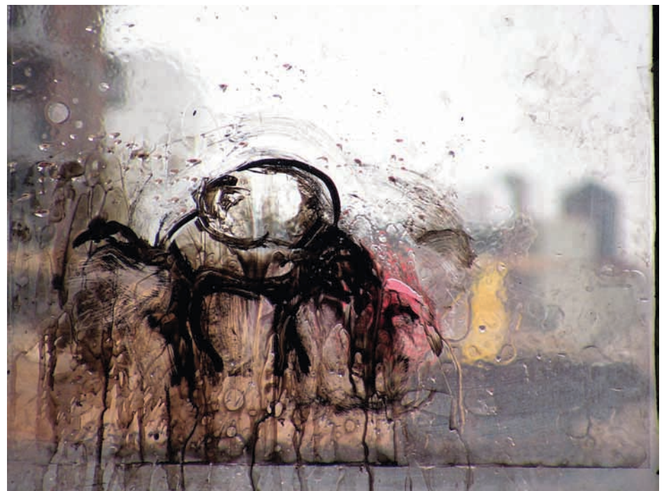
12 A single digital photograph, one of a sequence, in Ezra Wube's Indamora (2009) of the ink Amharic word metamorphosing into silhouetted nomadic figures.

Wube's work demonstrates versatility in dissemination and contexts of viewership that echo the oscillation that Buchan (2012) identifies within animation and its position in the high/low art divide. Furthermore, its straddling of different aesthetic forms and materials encourage their inclusion within and across different contexts and genres. In November 2013, Wube was commissioned to create an animated piece for the Times Square public art project Midnight Moment . This project involved utilizing electronic billboards and signs in a synchronized manner to screen and display different artists' creative content. Wube's At the Same Moment (2013) consisted of animated paintings that illustrated Wube's