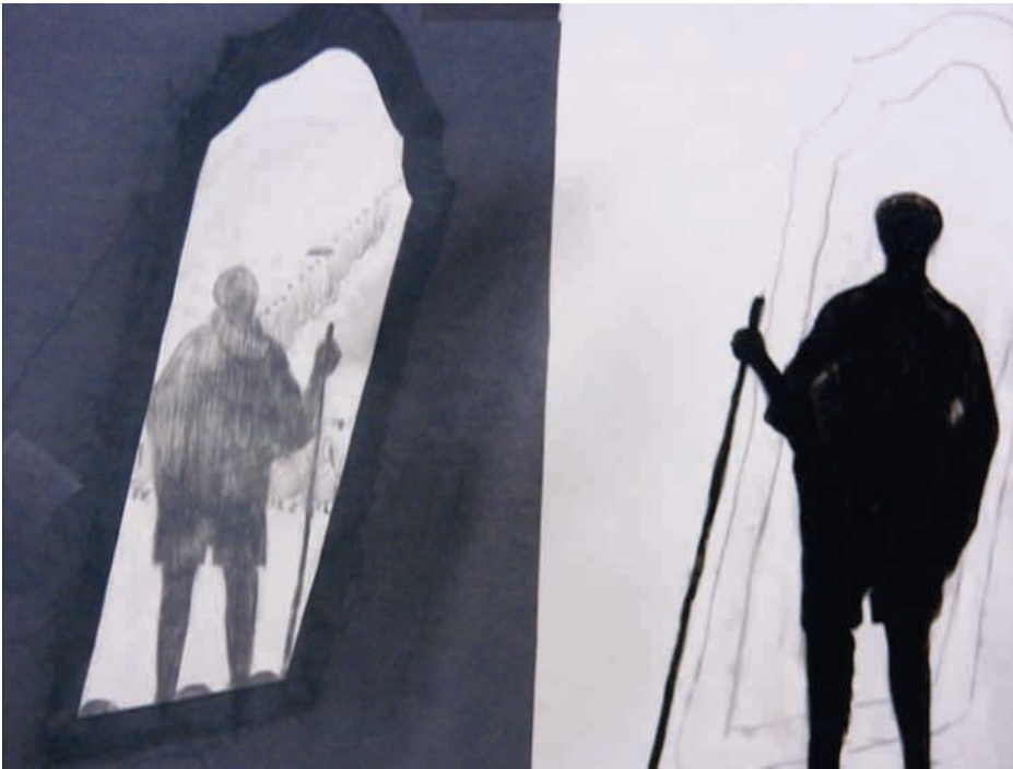
9 A still image from Ezra Wube's Hold the Door (2008) of a photograph of the artist with relatives as a montage including drawn silhouetted figures of nomads travelling within these frames.

courses on Orientalism and the feminization of the African continent (Said 1993, Mudimbe 1988). Mukii's accounts of these memories bear witness to practices that continue to be prolific in Kenya and sit within a history of discourses on beauty and whiteness that stem from the colonial project (Mukii 2013).