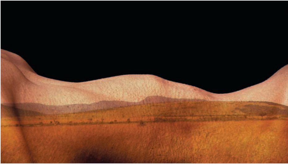
5 A still image from Ng'endo Mukii's Yellow Fever (2012) showing the projection of photographs of a Kenyan landscape upon the female performer.