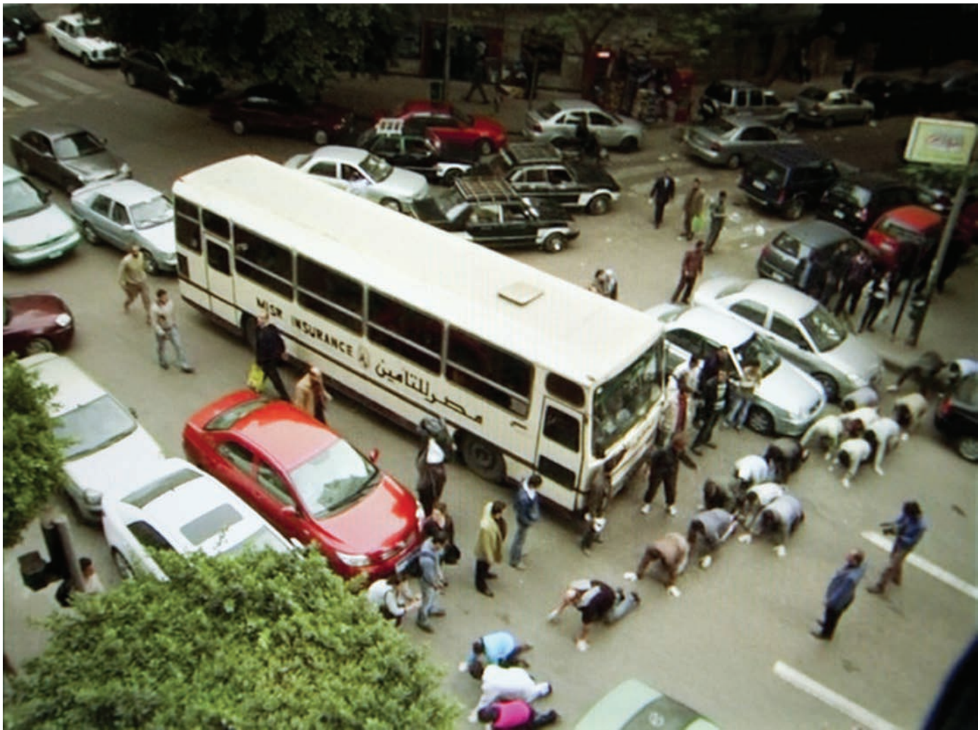
1 Amal Kenawy, still from The Silence of Lambs (2010); video work; 8:51 min

The performers cross Mahmoud Basiounny Street in downtown Cairo as observers watch. This image was captured shortly before Amal Kenawy was engaged in argument by a group of male cafe patrons.