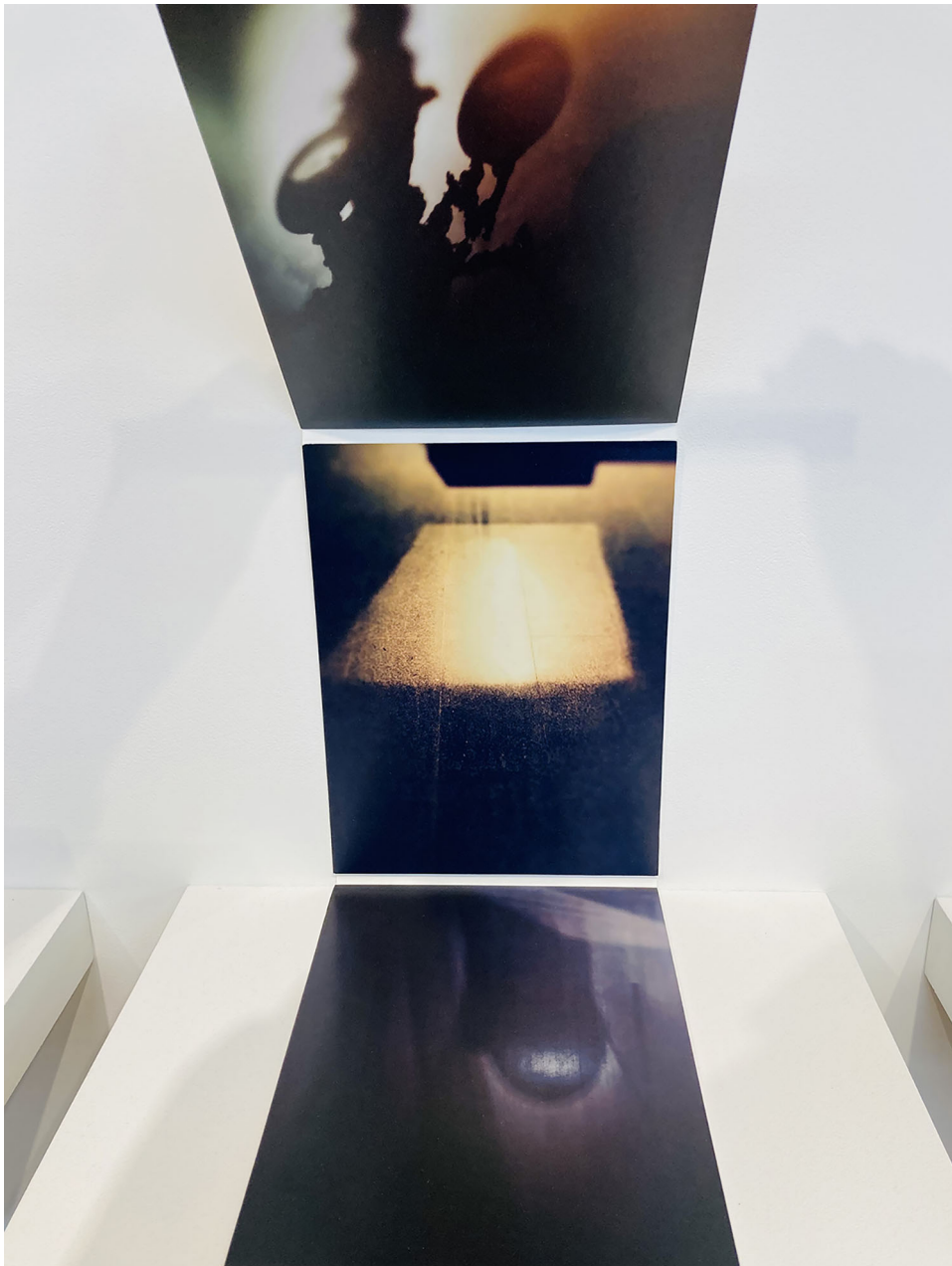
IMAGE 4. Folio 2, unfolded, of Dark Matter (2020) by Maureen Catbagan; courtesy the artist.

it allows us to feel and sense the dynamics that undergird racialization rather than imagine that race coalesces neatly into individuals or populations. Through Muñoz we can sense racialization as a relational structure whose impacts are not only sociological but that unfurl into more nebulous realms.