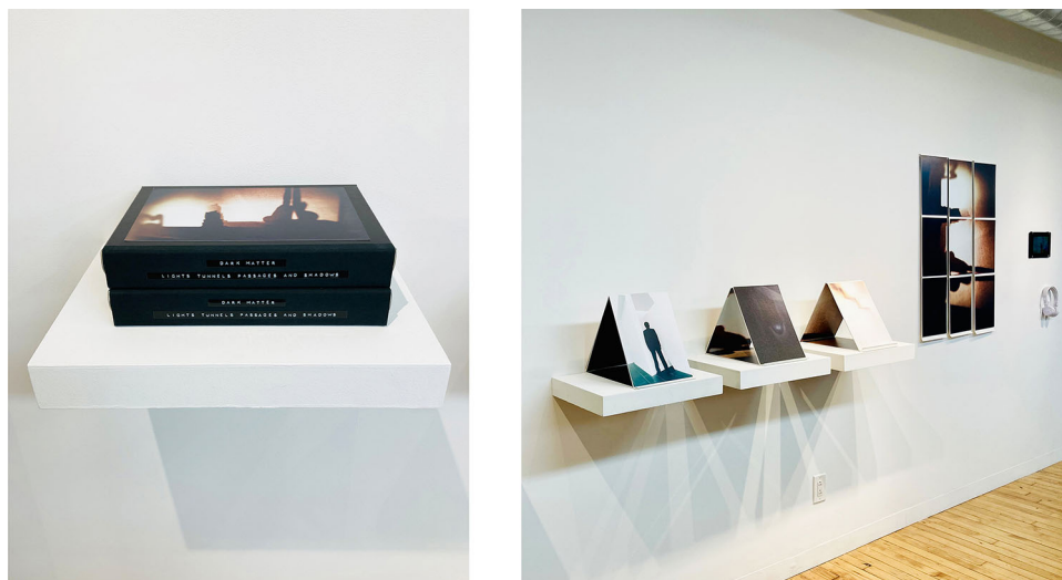
IMAGE 2. Installation view of Lights, Tunnels, Passages & Shadows by Maureen Catbagan, Center for Book Arts, 2021; courtesy the artist.

presence of brownness perpetually threatens the cobbled together façade of dominance. Embedded in this sense of irritation is the displeasure brought on by nonconformity and its durational quality because this unhappiness is brought about by being.