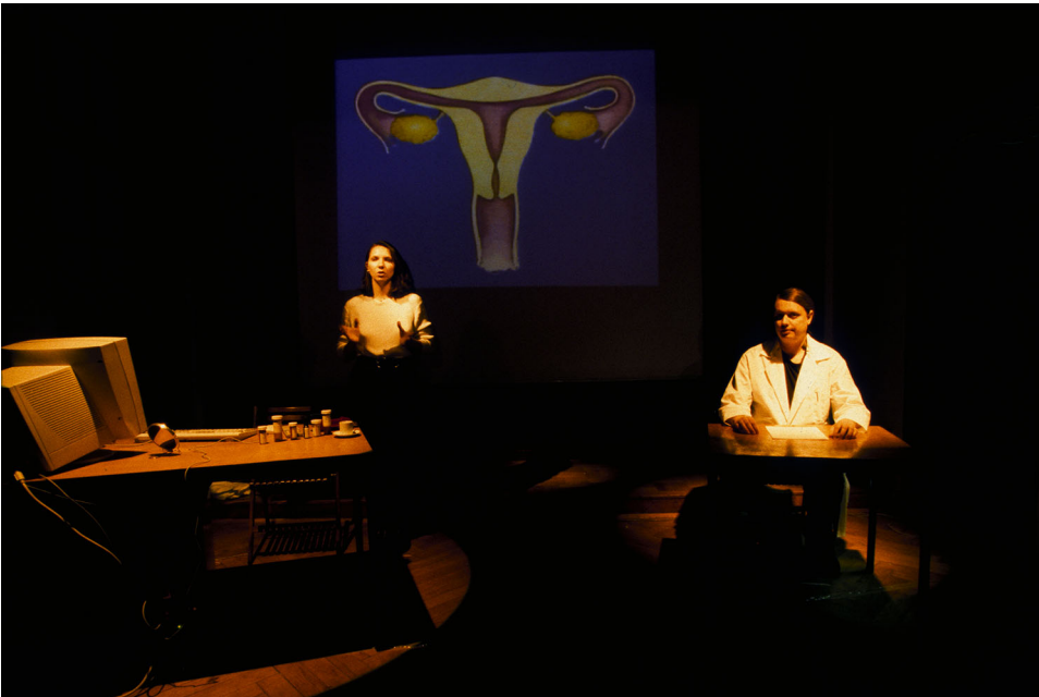
Installation view of Flesh Machine (1997–98) by Critical Art Ensemble at Beursschouwburg at Art and Science Collision , Beursschouwburg, Brussels (1998); courtesy Critical Art Ensemble.

data body can still be analyzed through biotechnology and more recent technologies like surveillance and artificial intelligence. The data body is, after all, a being reduced to information, data, and files for surveillance and marketing ends. Similarly, as we shall see, biotechnology also transforms the body or, more specifically, genes to code through bioinformatics. CAE explained that the body is “invaded” by imaging technologies, thereby making the body transparent, but this is done also for economic ends, marketing to individuals with “flesh products and services” like reproductive technologies. 28 In other words, the data body persists through the same logic of surveillance and marketing, and this continues throughout surveillance technologies and artificial intelligence. As we will see, however, artist-activists’ attempts to recuperate and rematerialize the body through performative demonstrations, like CAE’s embodied tactics of performance, challenge the datafication of the body today by different technologies.