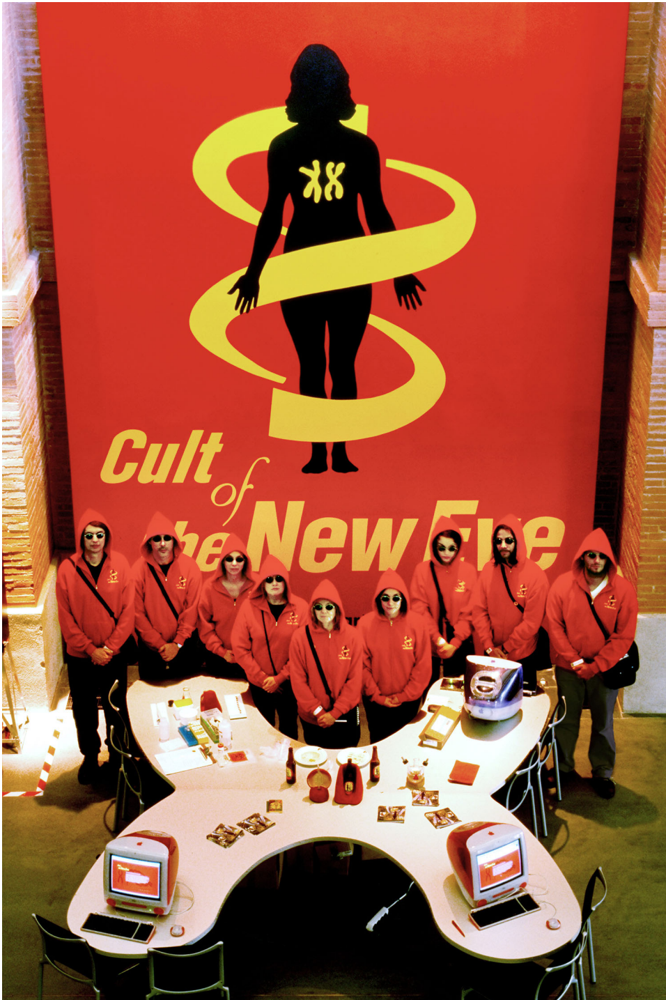
Installation view of Cult of the New Eve (1999–2000) by Critical Art Ensemble, Faith Wilding, and Paul Vanouse at Museum of Contemporary Art, Toulouse, France (2000); courtesy Critical Art Ensemble.