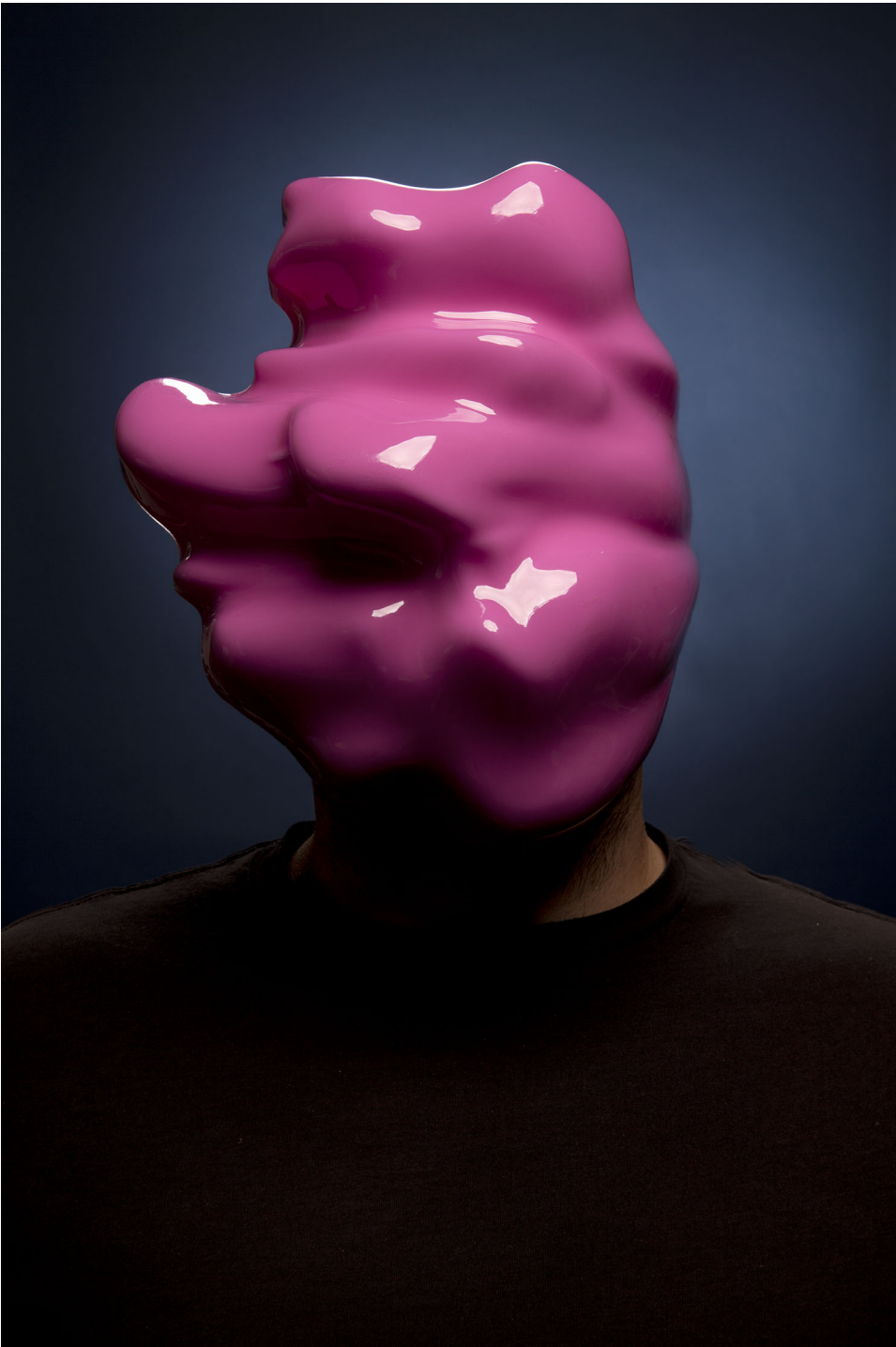
Fag Face Mask —October 20, 2012, Los Angeles, CA, from Facial Weaponization Suite (2012) by Zach Blas; courtesy the artist.