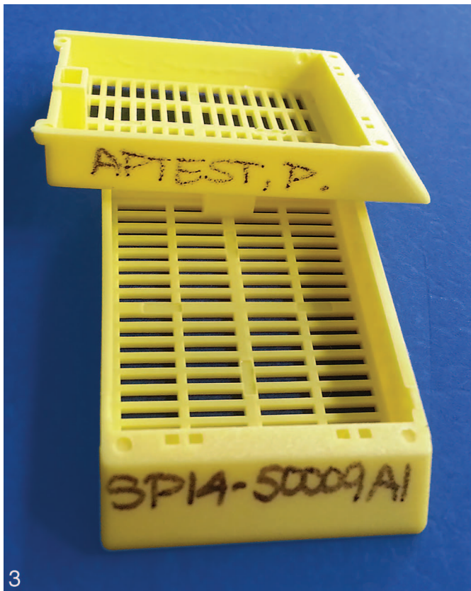
Figure 3. Laboratories in which patient identifiers are handwritten can use the sides of tissue cassettes to record additional identifiers.