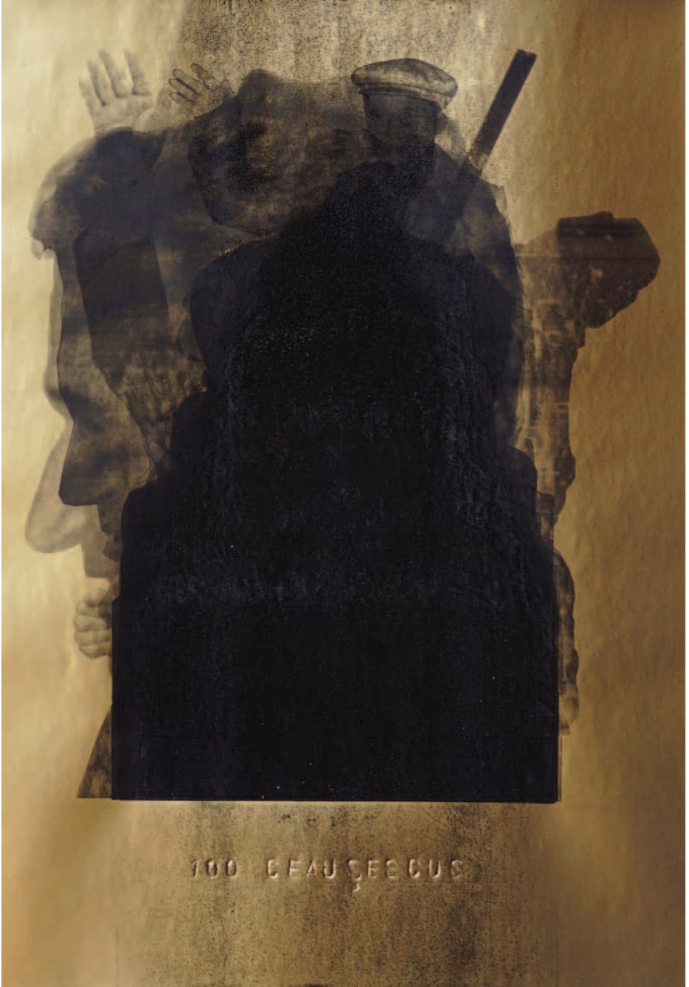
100 PORTRAITS OF CEAUȘESCU PRINTED ON ONE PAGE