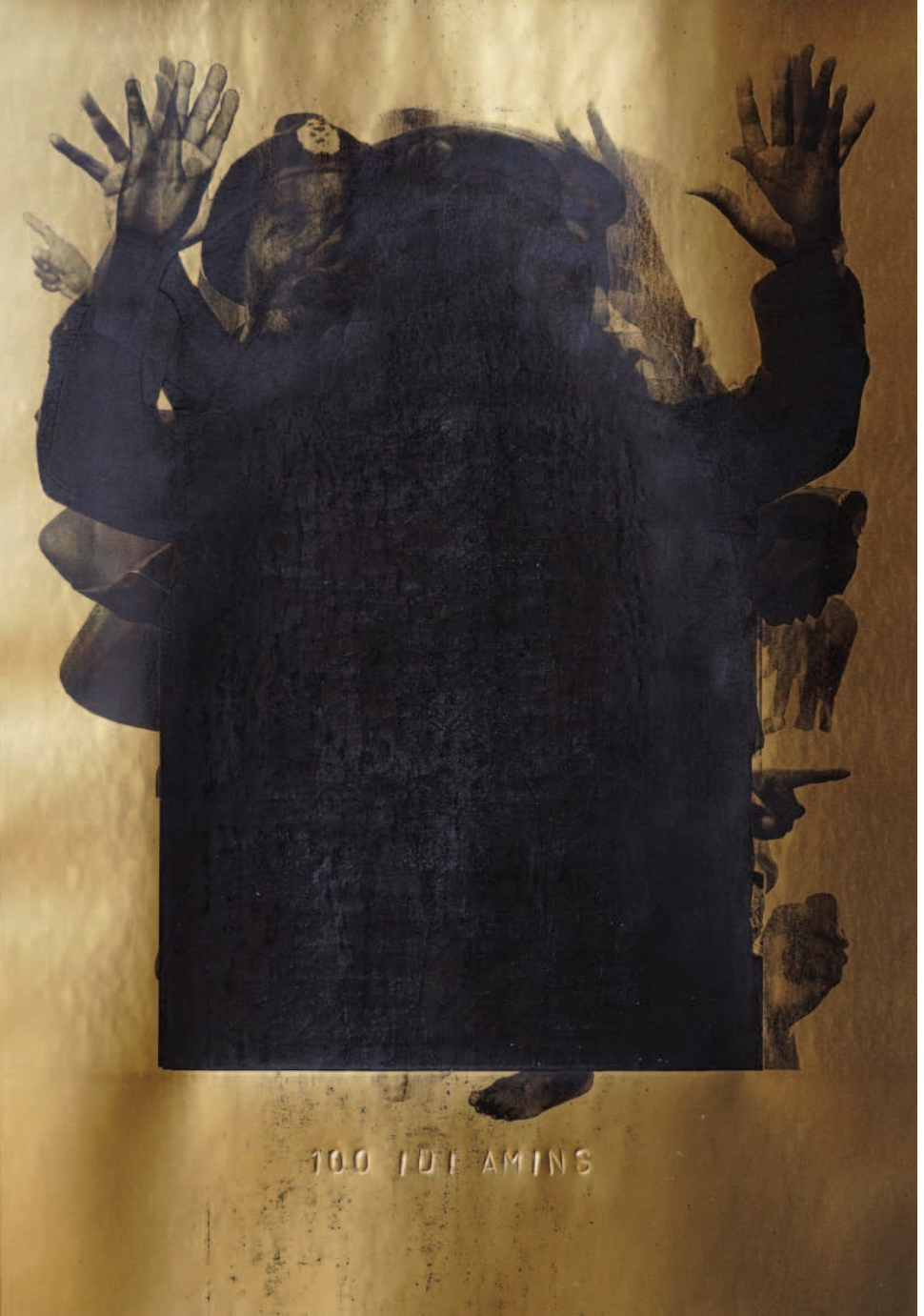
100 PORTRAITS OF IDI AMINS PRINTED ON ONE PAGE