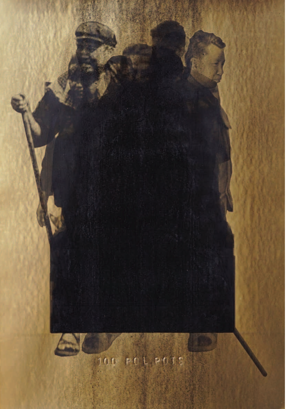
100 PORTRAITS OF POL POTS PRINTED ON ONE PAGE