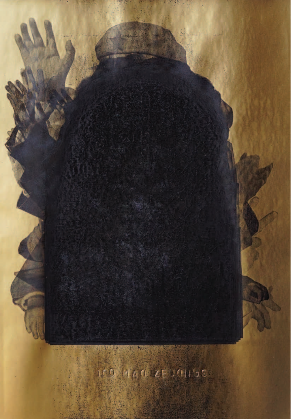
100 PORTRAITS OF MAO ZEDONGS PRINTED ON ONE PAGE