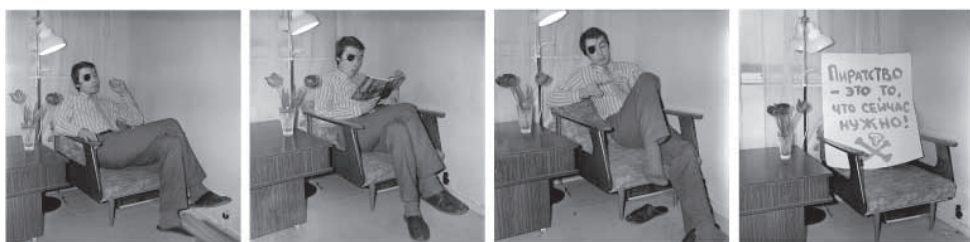
Piracy is what we need today , 1983. V. Zakharov.

being compiled that no one will ever analyze or systematize. No one has the strength or time for such a task. We live in an era when the past and the future have merged into one totalized present. There are no more gaps. Everything is one and indivisible. We only live for the preparation and publication of the next photograph or video. Only a computerized brain would be capable of retrieving from this archive any particular photograph, and it would do so only when it deems a particular image ideal for product marketing. This is the archive of our lives.