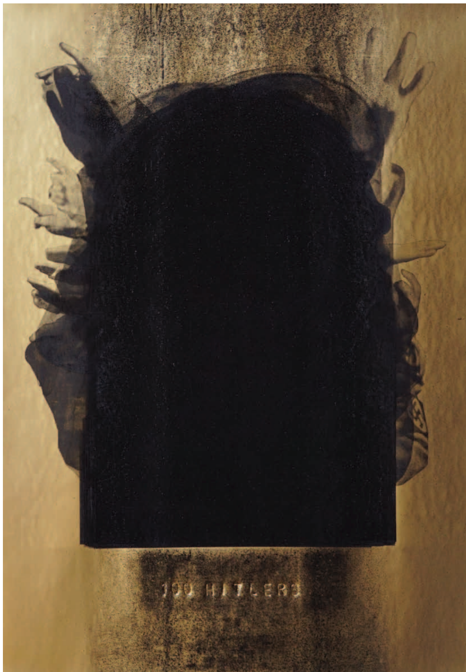
100 PORTRAITS OF HITLERS PRINTED ON ONE PAGE