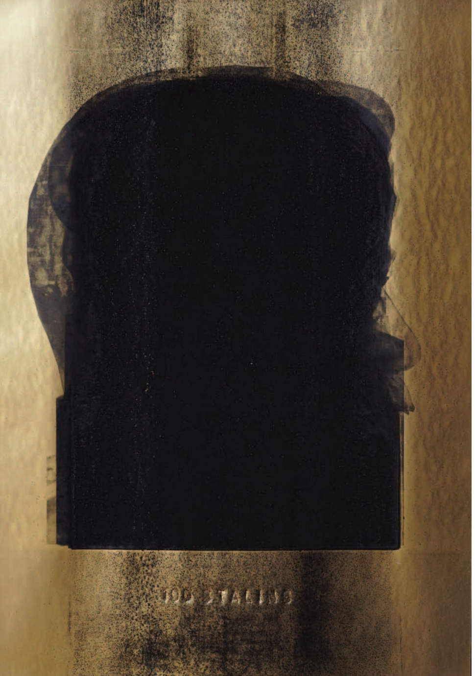
100 PORTRAITS OF STALINS PRINTED ON ONE PAGE