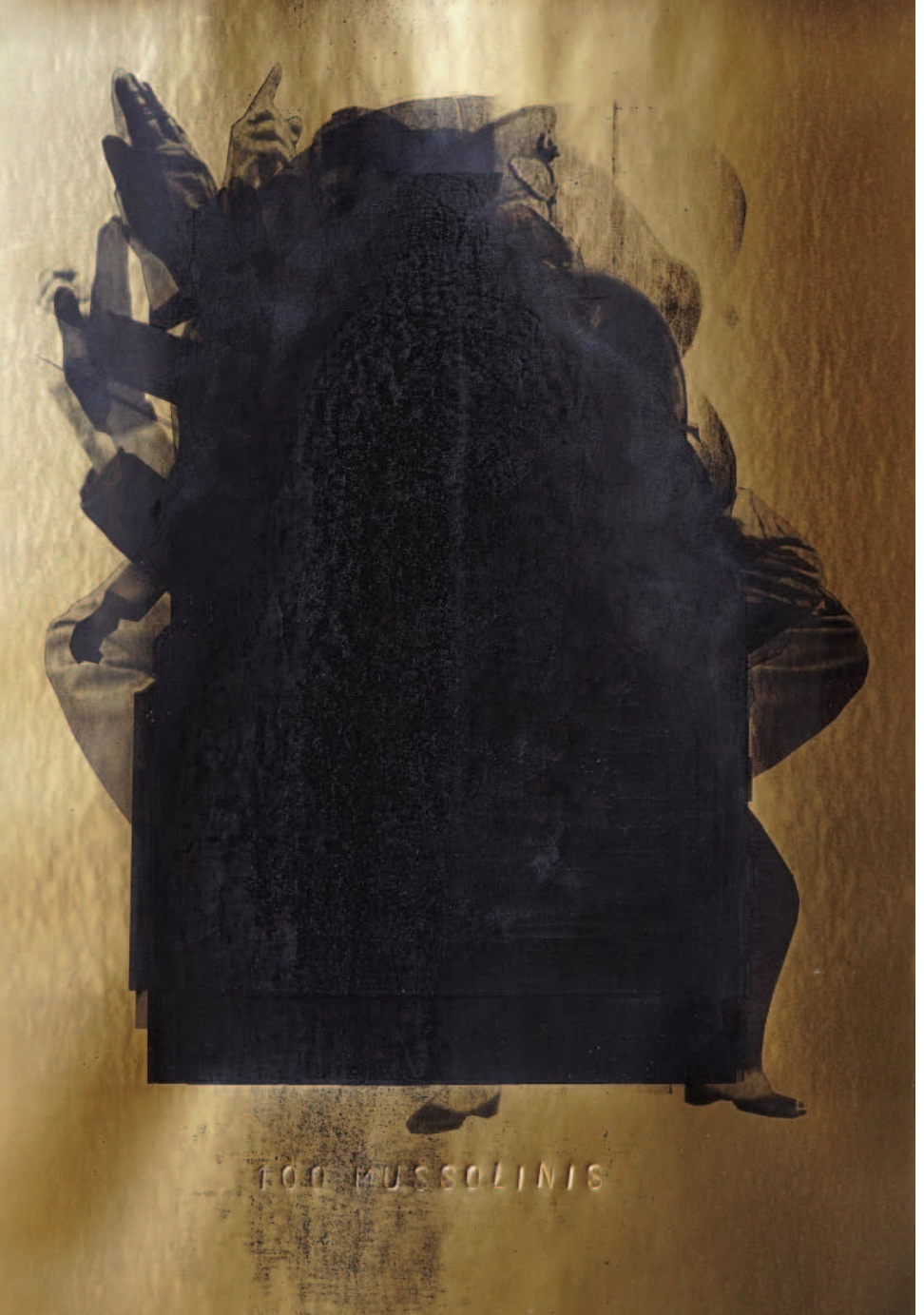
100 PORTRAITS OF MUSSOLINIS PRINTED ON ONE PAGE