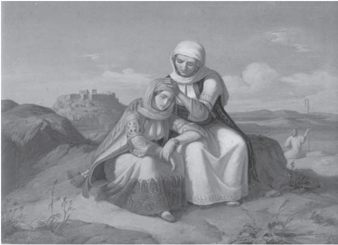
Theodoros Vryzakis. The Consolation (Solace) , 1847. Oil on canvas, 44 × 57 cm. National Gallery, Athens.

Nothing is missing: national costumes, sentimentalism, the reference to antiquity; a cool, “romantic” landscape. The only thing which Vryzakis was probably missing was the knowledge that this painting technique did not have its center in Munich, but in Paris. The Greek took from his center, namely Munich, what Munich had taken from its center, namely Paris—the model which Gustave Schnetz and Leopold Robert had worked out in Rome during the 1820s.