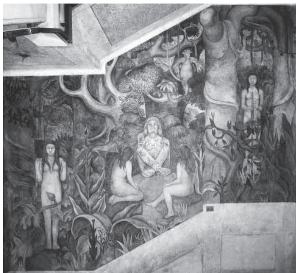
Diego Rivera. Tropical Mexico and the God Xochipilli and His Votaries, 1926. Fresco, north wall, Patio del Trabajo, Secretariat of Public Education Main Headquarters, Mexico City.

Let us briefly look at Tropical Mexico and the God Xochipilli and His Votaries , Rivera’s fresco in the staircase of the Ministry of Education, created around 1926. Despite all the adoption of elements from the art of the center (now and then influences from Gauguin, as is the case here; in other works adoptions from George Grosz, Otto Dix, even from Hodler), 16 we can say that the model character of the art center