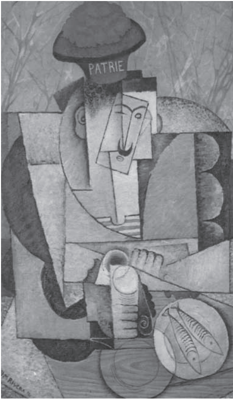
Diego Rivera. Sailor at Lunch (Marinero almorzando) , 1914. Oil on canvas, 114 x 170 cm. Museo Casa Diego Rivera, Guanajuato, Marte R. Gómez Collection, INBA. © 2020 Banco de México Diego Rivera Frida Kahlo Museums Trust, Mexico, D.F. / Artists Rights Society (ARS), New York.

center. 11 Undoubtedly, this is a model instance of what I am calling adaptation , conformation , or accommodation .