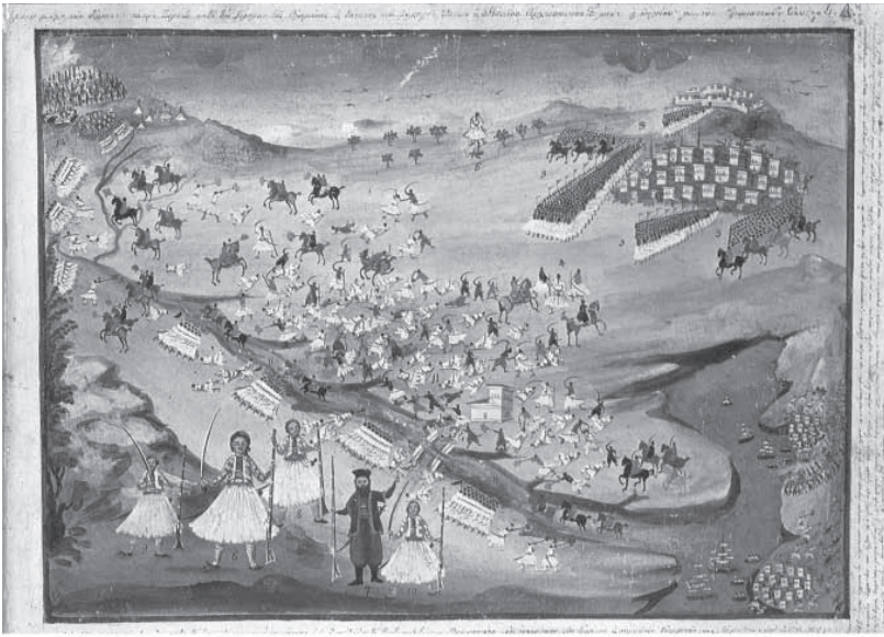
Panagiotis Zographos. First Battle of the Greeks against the Turks at the Bridge of Alamana , 1836–39. Watercolor on cardboard, 50 × 63 cm.

such an understanding of pictorial space; with the excessive attention that is paid to the main hero; with such an accumulation of figures full of local color in the foreground; etc. Obviously, Makriyannis did not want to hear or see anything of that nature. 8