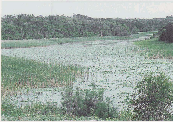
Plate 4a. Site of capture of Litoria aurea at Blue Lake, Yuraygir National Park on 18 October, 1994.