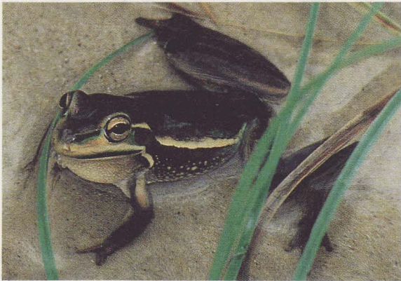
Plate 4b. Male L. aurea at edge of a temporary pond, Station Creek, on 8 March 1995.