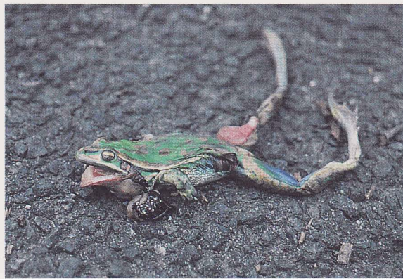
Plate 6b. A road-killed L. aurea . In situations where roads occur close to breeding sites, vehicles may contribute to a significant source of mortality.

fresh water swamps have been drained: (1) Foy's Swamp (adjacent to Coomonderry Swamp); (2) the extensive flood plains west of Coomonderry Swamp, extending from Coolangatta Mountain west to Bomaderry and north to Berry; (3) the extensive flood plains to the east and south-east of Nowra; (4) several unnamed swamps beside the Shoalhaven River (east of Ski Park, adjacent to bridge at Bomaderry and Ben's Walk); and (5) Omega Swamp (Kiama) (G. Daly, pers. obs.).