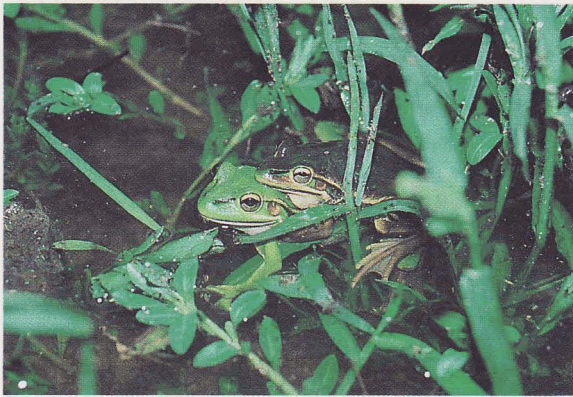
Plate 6a. A pair of L. aurea in amplexus at Shoalhaven Heads, New South Wales.