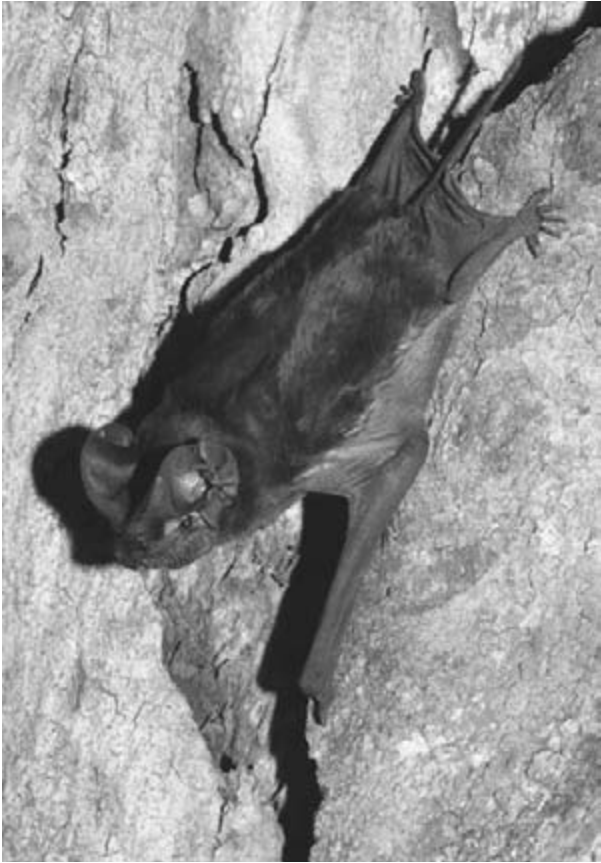
Figure 2 The White-striped Freetail Bat Tadarida australis , a species that is dependent on trees for roosting, was recorded during the survey in shrubland and Black Box woodland.

Scotorepens balstoni ). Some groups of species have very similar calls (Freetail Bats Mormopterus sp. (southern form)/ Mormopterus sp. (inland form) and Lesser Long-eared Bat Nyctophilus geoffroyi / Gould's Long-eared Bat N. gouldi / Greater Long-eared Bat N. timoriensis / Large-footed Myotis Myotis macropus ), and for these groups, identification to species level was not possible.