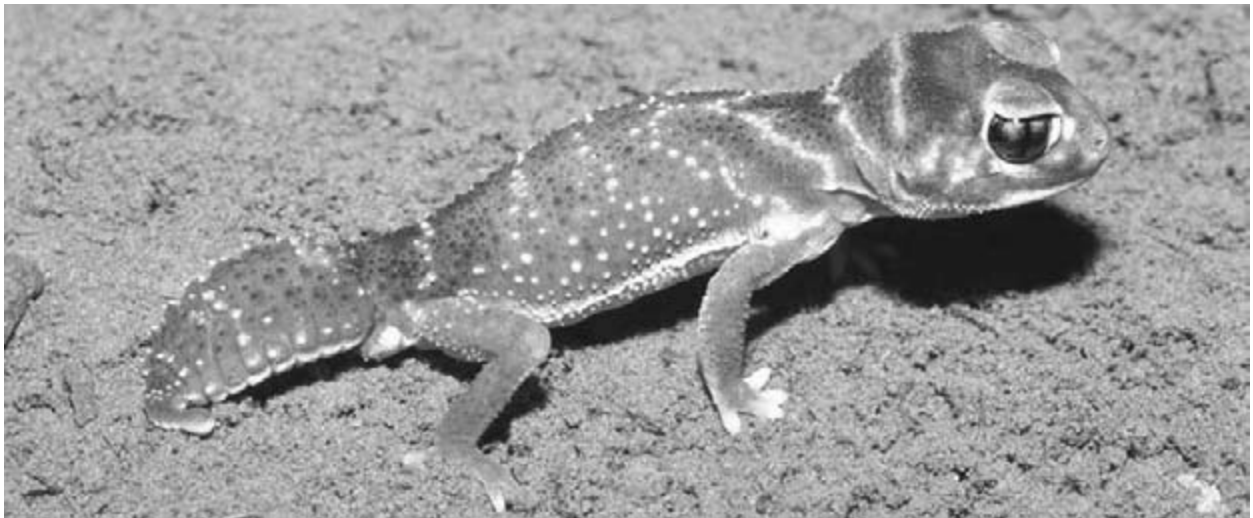
Figure 3 The nocturnal Smooth Knob-tailed Gecko Nephurus levis was recorded during the survey in shrubland habitats.

Regional significance is based on published documentation. The significance rating may vary, according to the source and the year, and is generally influenced by the extent of the area being considered. In many cases, the significance ranking is for western New South Wales, an extensive area that covers a broad environmental gradient. In this paper the principal sources of regional status for individual species include Dickman and Read (1992), Dickman et al. (1993), Smith et al. (1994), Sadlier and Pressey (1994), Sadlier et al. (1996), Ayers et al. (1996) and Mazzer et al. (1998).