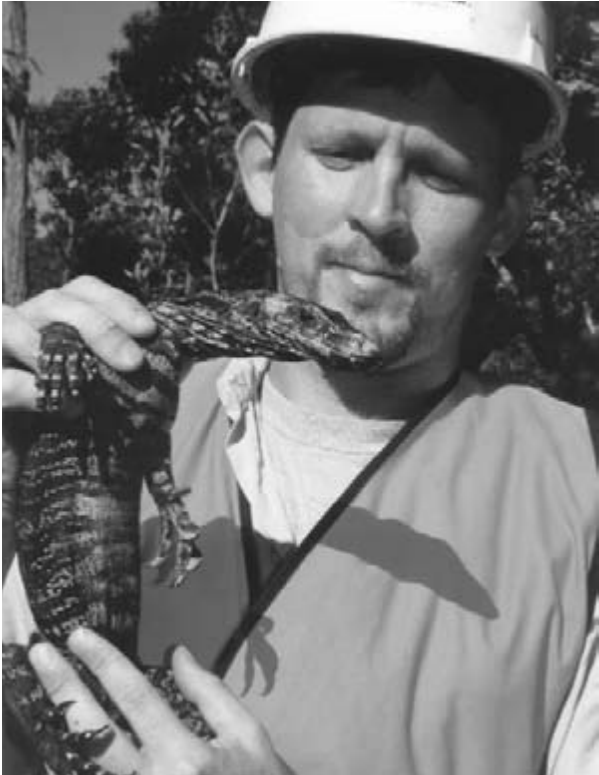
Figure 3. A lace monitor Varanus varius captured in the open trench in East Gippsland, Vic. by S. Doody.