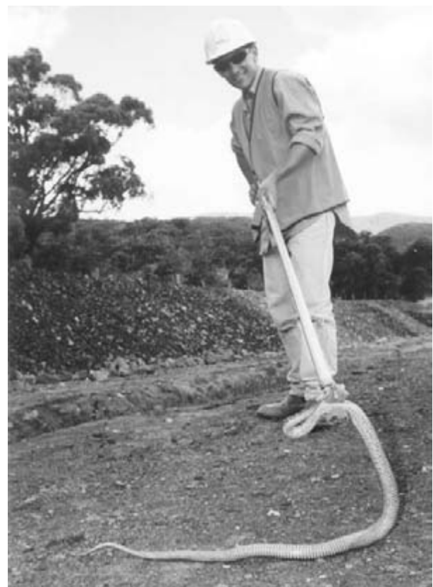
Figure 2. An eastern brown snake Pseudonaja textilis captured in the open trench near Captains Flat, NSW by E. Guarino.

After discovering that many frogs and possibly other small animals were hiding under soil and debris in the trench, and thus going undetected, we employed funnel traps opportunistically into the trench in East Gippsland. Funnel traps were constructed of hardware wire (0.5 cm mesh) and were ca. 1 m long, consisting of a 30 cm diameter cylinder and wire funnels on each end (see Heyer et al. 1994). Funnels were made to span the entire trench width such that animals that were small enough to fit into the funnels (ca. 7 cm diam.) were trapped as they moved along the trench bottom. A string tied to traps allowed them to be checked without personnel entering the trench. Traps were checked in the morning to prevent desiccation and over-exposure.