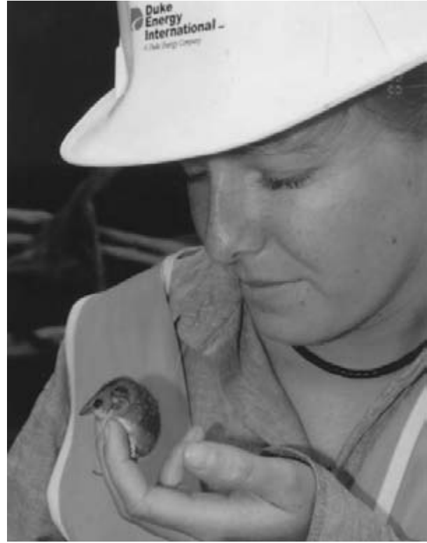
Figure 4. A common dunnart Sminthopsis murinus , captured in the open trench near Nowra, NSW by N. Bishop.

Table 2. Listed fauna species found during construction of the EGP in 1999-2000. For listings, AUS = Environment Protection and Biodiversity Conservation Act (1999), NSW = NSW Threatened Species Conservation Act (1995), Vic = Flora and Fauna Guarantee Act (1988). For location, T = trench, R = pipeline route prior to construction, A = adjacent habitat. For designation, P = national park, R = nature reserve, U = unprotected area. Abundance data reflect only captures within the listed state (see listing column).