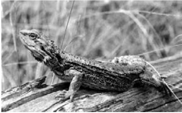
Figure 1 Adult Pogona barbata basking on a log (Moonbi Ranges, NSW).