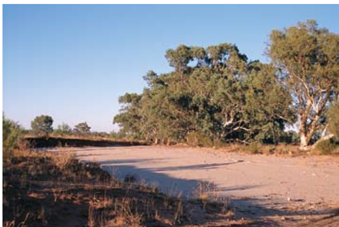
Figure 3. Dry creek bed and flats.

Creek beds and flats (pit trap sites 4 & 5) (Figure 3). There are several large sandy creek beds which flow out from the gorges. These did not contain water during the surveys but carried large volumes during heavy rain. River Red Gums lined these creeks and there were thickets of acacias and other shrubs. In some areas there were adjacent flats, which were susceptible to flooding from creek overflow. These usually had quite dense ground cover and scrub.