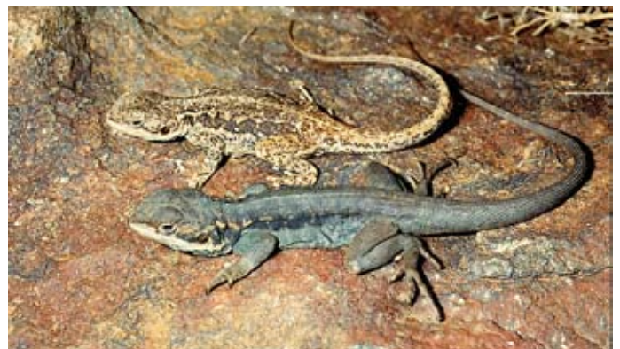
Figure 9. Ctenophorus decresii .