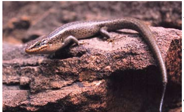
Figure 7. Egernia margaretae .