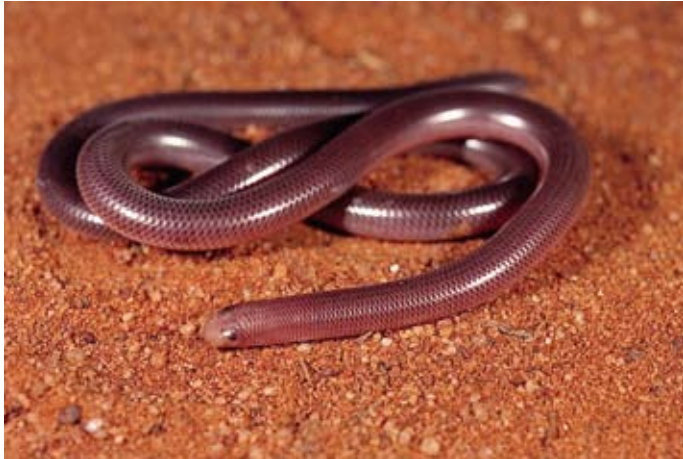
Figure 10. Ramphotyphlops endoterus .