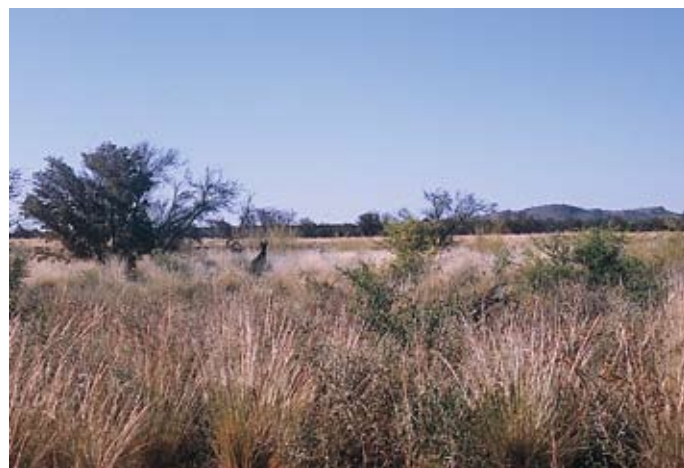
Figure 5. Red soil grasslands.

Gibber flats (pit trap site 9). These were treeless areas with sparse grasses and ground almost completely covered with small stones.