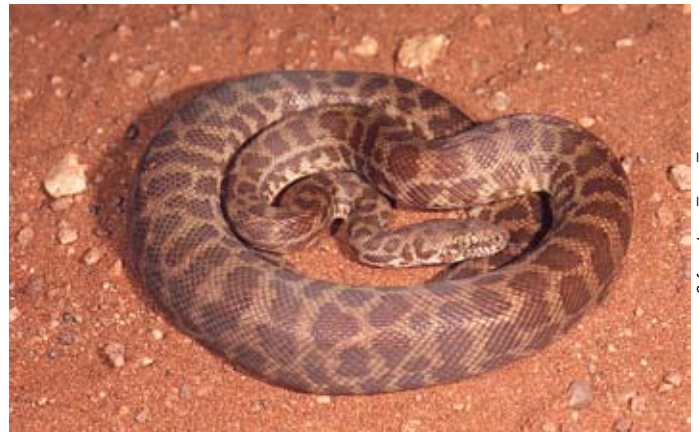
Figure 8. Antaresia stimsoni .