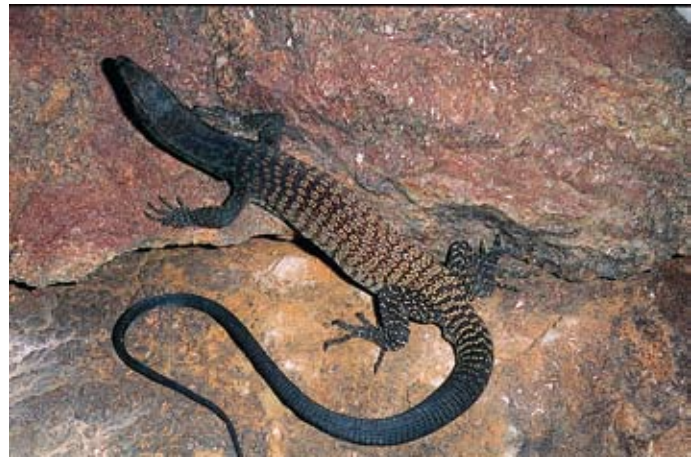
Figure 6. Varanus tristis tristis .

While only three individuals of Neobatrachus sudelli were recorded, the tadpoles of this species were abundant in the gorges and ephemeral wetlands on the red soil.