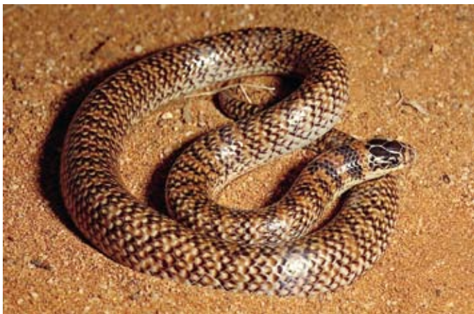
Figure 11. Brachyuophis fasciolatus .