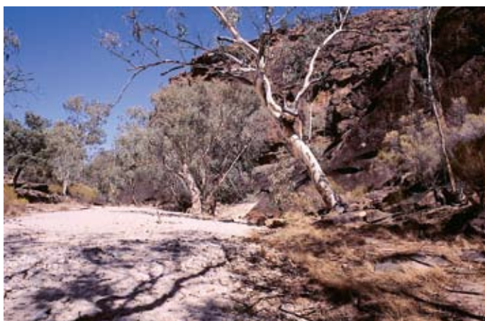
Figure 2. Homestead Gorge.

Gorges within the Bynguano Range (Figure 2). The main features of this area, the rocky sides and the floor of the gorges, were searched. On some occasions there were pools of water in the gorges. River Red Gums Eucalyptus camaldulensis lined the floor of the gorges, and grasses and shrubs were extensive.