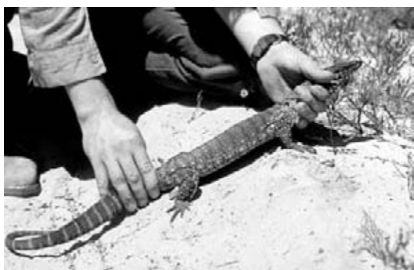
Figure 3. A male Rosenberg's Goanna Varanus rosenbergi . This is the first confirmed record of this species from the Little Desert National Park.

1, p < 0.0001 ). Both mammals captured in Elliott traps ( Mus musculus and Pseudomys apodemoides ) were also caught in pitfall traps, whilst the Stumpy-tailed Lizard Trachydosaurus rugosus was only caught in Elliott traps. In contrast, 17 species that were recorded from pitfall traps were not captured in Elliott traps (Table 1). The success of Elliott traps was lowest at Site B, where only three T. rugosus were trapped. At Site C, Elliott traps captured all three of these species during the third session, but only the mammals during the second session, and nothing during the first session. Site A returned the greatest number of animals captured in Elliott traps; an overall total of 78 captures of these three species. Pseudomys apodemoides formed the majority of captures in Elliott traps (74%), and was captured significantly more frequently in Elliott ( n = 68 ) than pitfall traps ( n = 44 ), ( \chi^2 = 5.142 , d.f. = 1, p = 0.023 ).