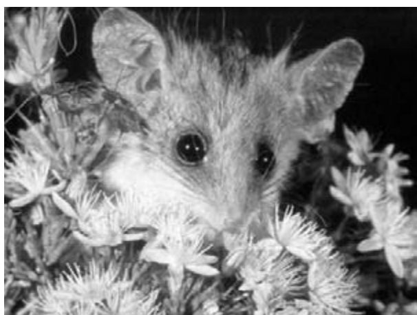
Figure 2. The Little Pygmy-possum Cercartetus lepidus . This animal is the first confirmed record of this species from the Little Desert National Park.

Similarly, our observations of two Rosenberg's Goannas V. rosenbergi represent the first records of this species from the LDNP. The first individual, an adult, was walking along Mallee Track (36° 31' S 141° 53' E) when observed at 1130 hrs (Eastern Summer Time) on 1 October 2002. When pursued, this lizard rapidly scaled a mallee eucalypt beside the track, and was not captured. The