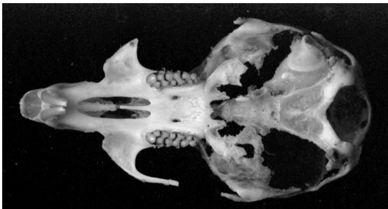
Figure 1: Skull of New Holland Mouse (Australian Museum specimen M33380) collected near Torrington in 1997. This opportunistically collected specimen lends credence to statements by John Gould and John Gilbert that the distribution of the New Holland Mouse in the 19 th Century extended to the western slopes, and suggests that the current assessment of the species as secure in NSW with minimal reduction in range since European settlement should be reconsidered.

The collection site (151° 36' E, 29° 20' S) (Fig. 2) was located on a low rocky ridge north of the Beardy River, just outside the southern boundary of Torrington State Recreation Area and approximately 12 km north of the village of Emmaville. The Beardy River is within the