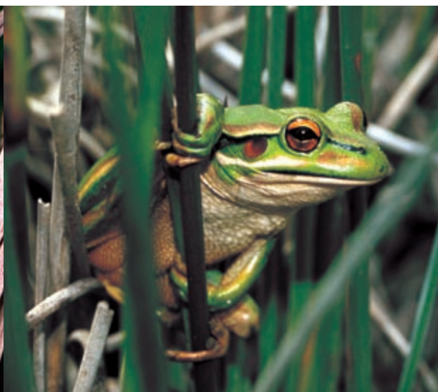
Figure 7. Bell frog resting amongst jointed rush Juncus articulatus .

The SU lengths of frogs captured in different months in 1999/00 were compared. Samples were pooled for Coomaditchy Lagoon and South Pond using captures in October, November and January. Differences could indicate either that frogs were growing larger during the season or that different cohorts of frogs dominated (or became more active) during different months of the breeding season.