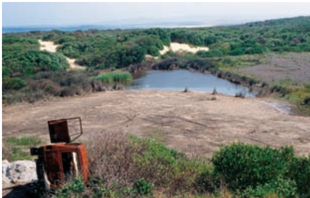
Figure 4. South pond in the sand dunes behind Port Kembla beach.