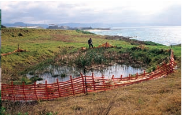
Figure 5. The constructed pond at Boilers Point, Gloucester Boulevard.