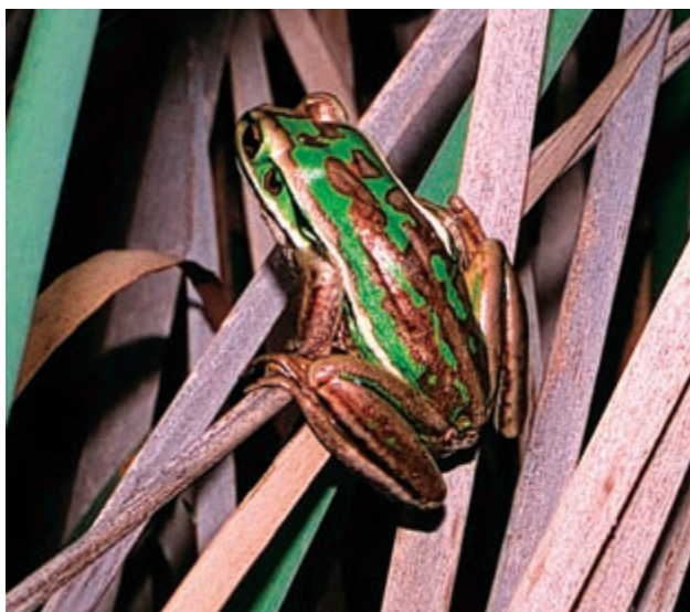
Figure 6. Bell frog resting amongst cumbungi.

spring at Coomaditchy Lagoon. Surveys at South Pond commenced in November 1998 when it was first located. We searched the entire periphery of each breeding site on foot with a 50 W spotlight during nocturnal surveys. This included searching the water's edge as well as any fringing vegetation within 5 m (Fig. 7). We followed the NSW frog hygiene protocol (NPWS 2000).