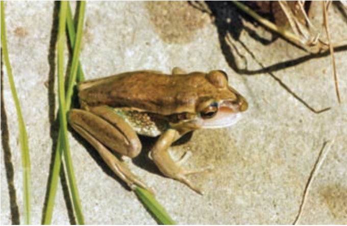
Figure 5. Injured bell frog rescued from Black Rat, Marrickville, January 1999.

eliminated. No further deaths resulted from predation. One adult frog managed to escape the confines of the nursery and was found dead (run-over) the next day about 350 m from the frog pond