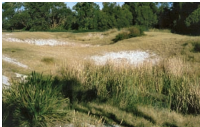
Figure 3. Ephemeral bell frog pond at Sir Joseph Banks Park, Botany, March 1997.

The captive-breeding program at Taronga Zoo had proven very successful and in March 1996 the first translocation was carried out: 500 advanced bell frog tadpoles and 50 juvenile frogs were released into the two large ponds at Botany. At about this time, events had taken place that allowed the developer to be released from some of the conditions of the original licence; the translocation had become the determinant for the destruction of the frog pond at Rosebery. As no provision had been put in place for monitoring the translocated population, the only follow-up monitoring was done on an opportunistic basis and was carried out by interested biologists.