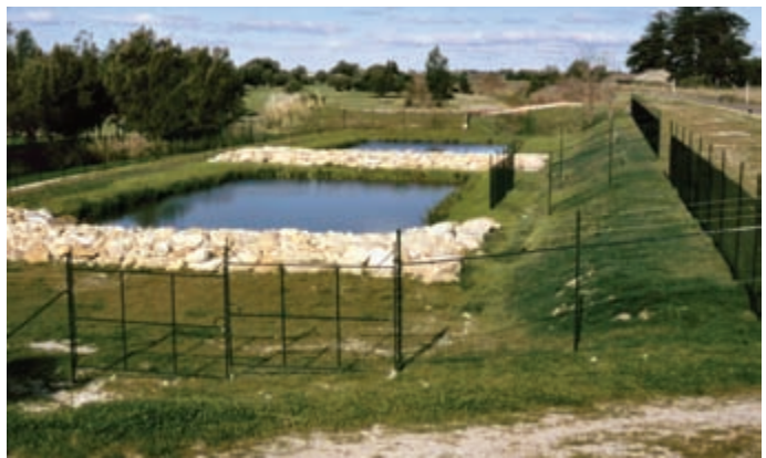
Figure 2. Bell frog ponds at Arncliffe and associated boulder fields, May 2000.

Two large ponds measuring 25 m long and 20 m wide were constructed in 1999 adjacent to the Kogarah Golf Course (Fig. 2). The ponds and the surrounding area of grassland were fenced off using cyclone wire fencing to exclude foxes and people from the site. The ponds had a maximum depth of 1 m and had a shallow area at one end of the pond only. The ponds were designed in this fashion to make them less suitable for species such as Striped Marsh Frogs Limnodynastes peronii . Bell frogs were still present in the Marsh Street wetlands and quickly colonised the new ponds.