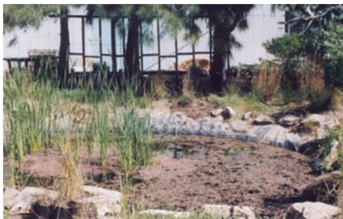
Figure 4. Bell frog pond at Marrickville, March 1998.

In 1997, Marrickville City Council made available a small portion of land in the community nursery in the Addison Road Community Centre for the creation of a "back-yard" frog pond (Caiwood 1997). The Georges River Catchment Management Committee provided the funds to prepare the site. A 4.5 m diameter pond was constructed which had a maximum depth of 50 cm. The base of the pond