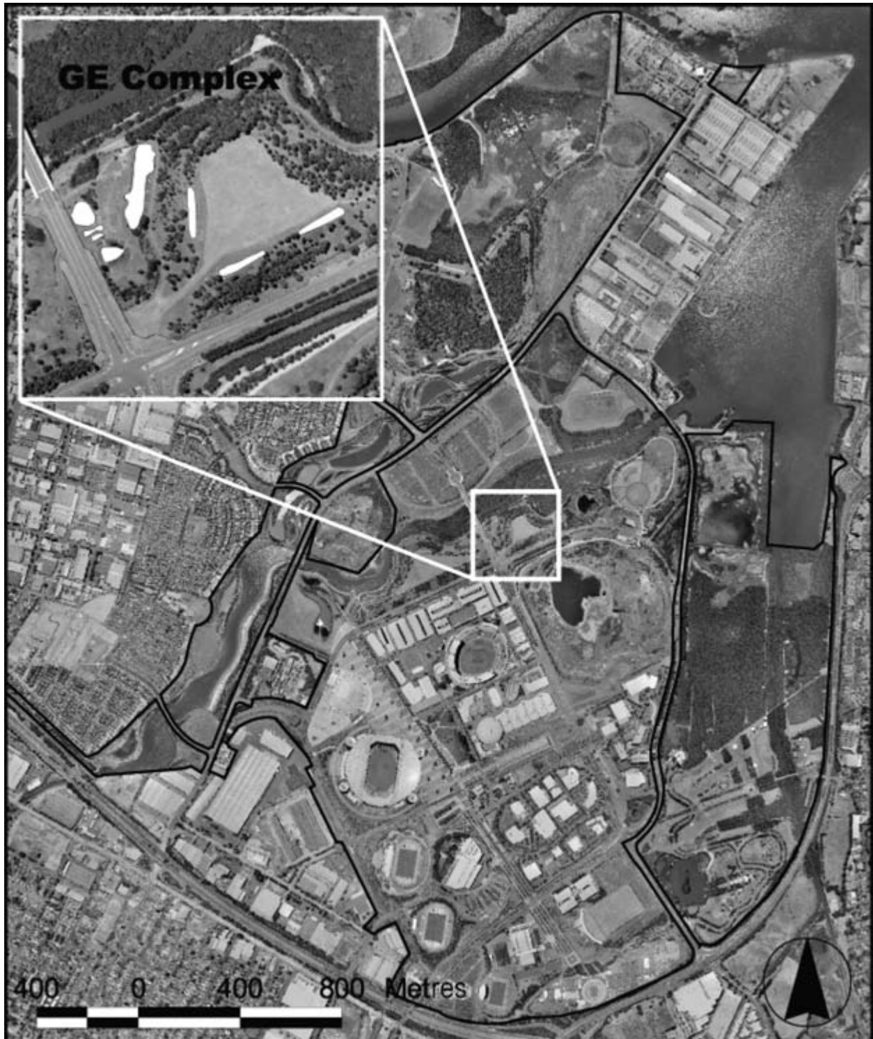
Figure 1. Sydney Olympic Park, with an insert of the GE complex where the mortality event occurred.

Frogs were located during nocturnal spotlight transects in and around habitat ponds at approximately six weekly intervals between the months of November and May. During these surveys, counts were made of the number of visible and calling adult and juvenile Green and Golden Bell Frogs. Habitat areas that were searched included all aquatic vegetation (primarily Typha orientalis and Juncus spp.), open water sections, vegetated and bare earth sections of the pond edge and the terrestrial grass areas within 5 m of the pond edge and those between individual ponds. All surveys