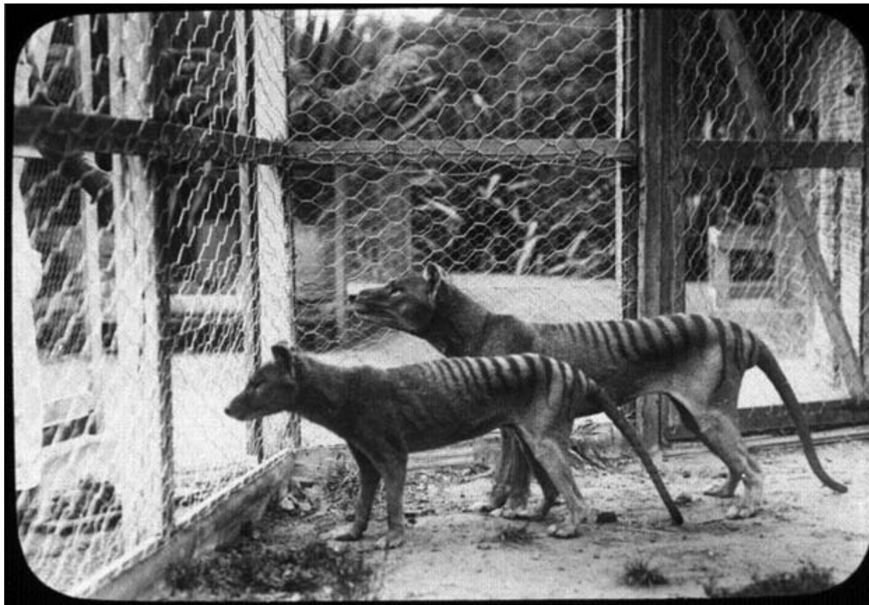
Figure 3. Two thylacines, Beaumaris Zoo, most probably taken by Tucker, 27 th September 1911. (Tasmanian Museum and Art Gallery)

Freeman notes that "Photographs are seductive" (2005, p1). Expanding this, probably it should be noted that photographs of large, extinct, carnivores are particularly seductive. Freeman valuably suggests the need for the semiotic analysis of photographs, those signs inherent in visual images, the complex associations they generate, and of "how particular readings construct ideas about an image" (p5). Figure 3 stands as a grand illustration of Freeman's thesis.