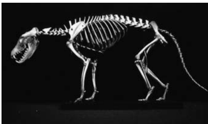
Figure 5. The mounted skeleton of the Tyenna male.