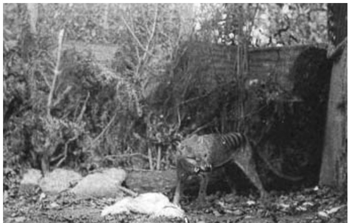
Figure 10. Thylacine with chicken moved from the place of its original deposition, photographed by Burrell. (Freeman, 2005, Figure 8)

So many of Freeman's concerns with the Burrell photographs, over the "classic profile position" (p6) and their appearance as "staged" rather than the result of hours