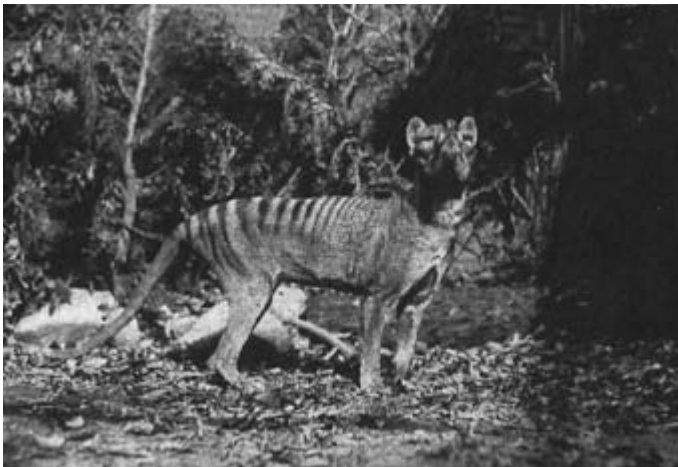
Figure 8. Thylacine about to be given chicken, photographed by Burrell. (Freeman, 2005, Figure 6)