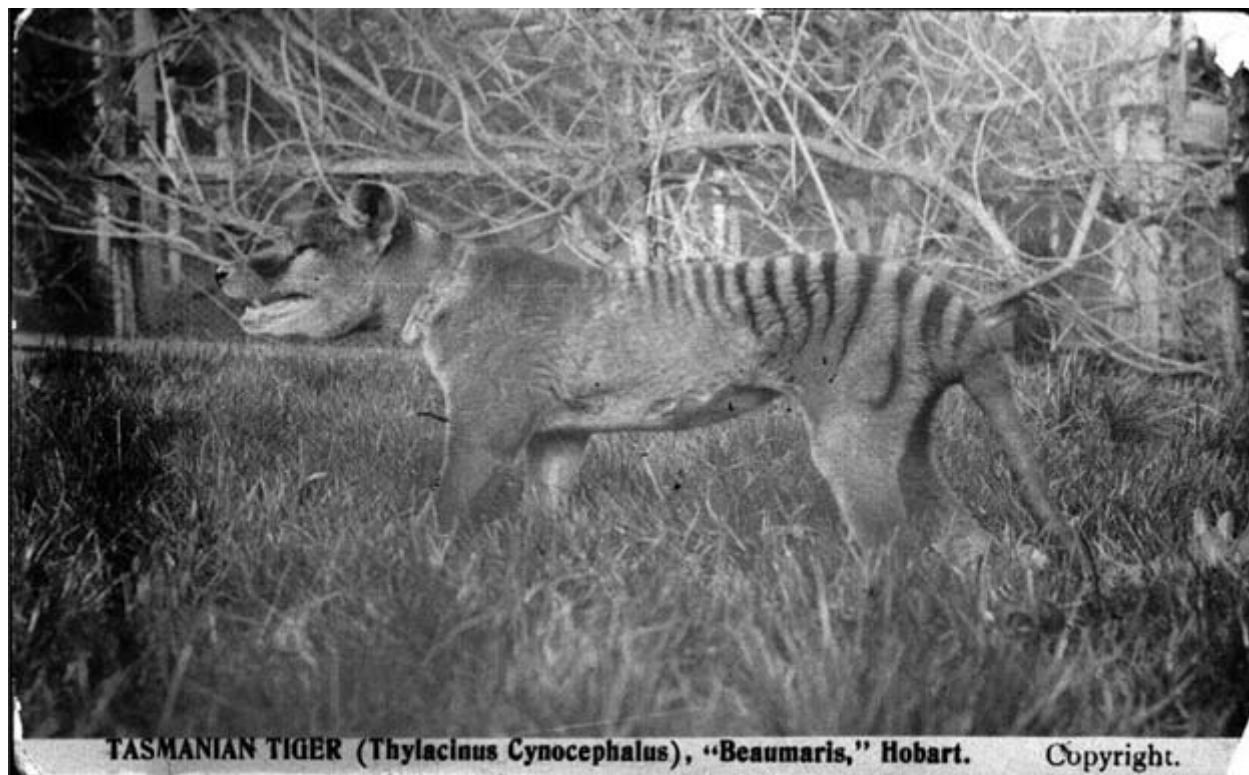
Figure 2. The newly arrived Tyenna male, unknown photographer, August 1911. (Tasmanian Museum and Art Gallery)

The male was photographed in its temporary enclosure by an unrecorded photographer, and Roberts was so impressed with the result that she had copies run off and available for sale as a post-card from the zoo (Figure 2). Of particular interest in this photograph are the marks