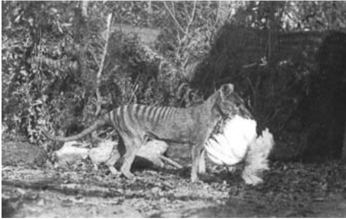
Figure 6. Thylacine with chicken in mouth, photographed by Burrell. (Freeman, 2005, Figure 2)