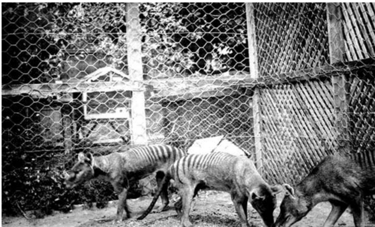
Figure 4. Three thylacines in Beaumaris Zoo. The Tyenna male at the rear, Woolnorth female centre, and head of male cub at the right.