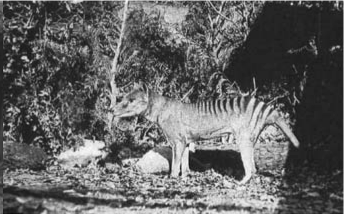
Figure 7. Thylacine prior to being given chicken, photographed by Burrell. (Freeman, 2005, Figure 4)