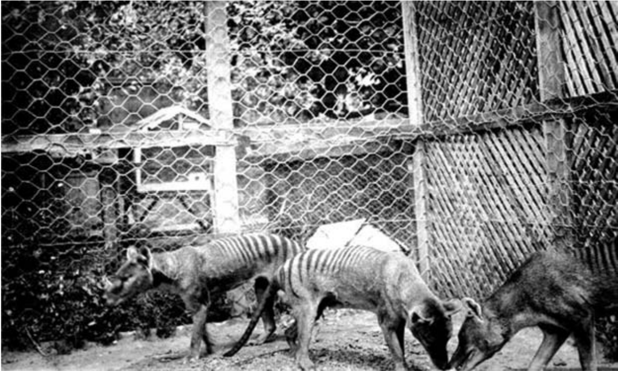
Figure 4. Three thylacines in Beaumaris Zoo. The Tyenna male at the rear, Woolnorth female centre, and head of male cub at the right.