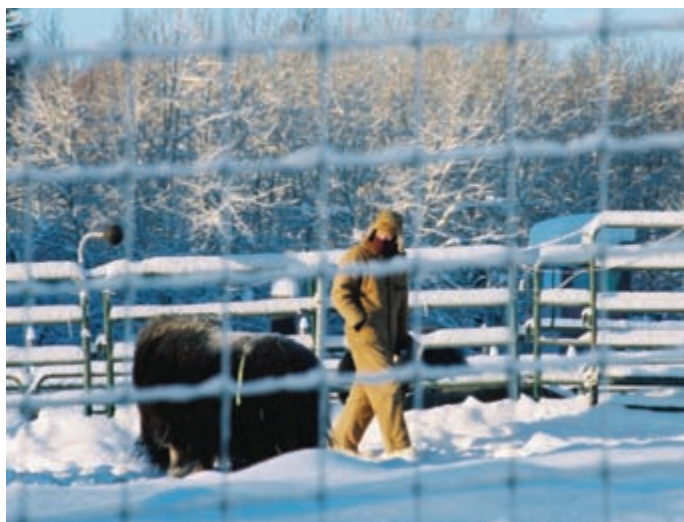
Figure 1b. AM waiting for muskoxen to defecate a data point.

AM's research investigated the behaviour, feed intakes and surface temperatures of juvenile and adult muskoxen at LARS (Figure 1b). Like the red kangaroos in Australia, juvenile mortality in muskoxen is typically higher than that of adults, especially during harsh winter conditions