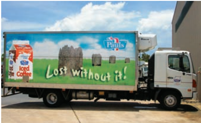
Figure 2. A billboard advertising a milk drink on the side of a truck presumably refers to the way A. meridionalis termite mounds can save the lost traveller. This advertising campaign also played on the Northern Territory identity of the mounds.

meridian, a feat most people would struggle to achieve without using a compass? This story is about those, including Gordon Grigg and myself, who sought to answer these questions by scientific investigation.