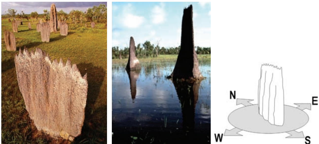
Figure 1. A. meridionalis mounds in dry conditions (left) and seasonally-flooded conditions (centre). The orientation is shown at right.

In contrast to their makers then, these mounds certainly are something to write home about, and they have become minor celebrities featuring in numerous newspaper and magazine articles, television documentaries and even advertising campaigns (Fig. 2). These celebrities have also inspired wonder in many observers and have prompted a number of questions. Why do these termites construct such remarkably shaped mounds? What’s more, why do these tiny, eyeless insects align such massive constructions to the