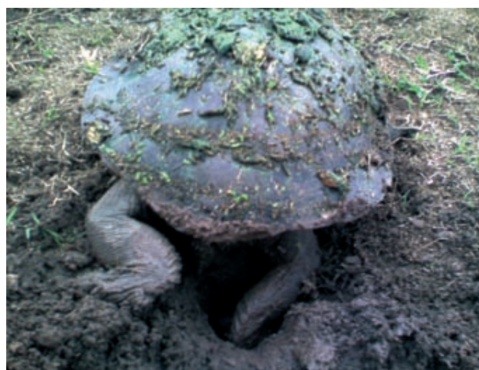
Figure 2. Nest construction in the broad-shelled river turtle Chelodina expansa . One hind foot at a time is inserted into the nest to scoop out the soil.