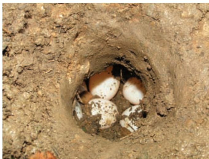
Figure 7. View into a C. expansa nest after egg laying has been completed but before back-filling has commenced. Note the flask-like shape of nest chamber which allows more eggs to be placed deeper in the soil compared to if the nest chamber had vertical walls.

Although water stored in the bladder and or cloaca may be deposited into the nest during the nest construction process or during egg laying itself (Curtis 1928; D.T. Booth unpublished data), neither C. expansa nor E. signata was ever observed to make several trips from the water to the nest to deposit water as has been reported to occur in C. longicollis (Cann 1988). However, this behaviour was not observed in C. longicollis by Vestjens (1969). Indeed, it appears that once a nesting site has been left the female turtle never returns to it. The deposition of fluid from the cloaca onto the nest plug after refilling as described by Cann (1998) and the 'puddles' behaviour in which cloacal fluid is mixed with soil and eggs in clay