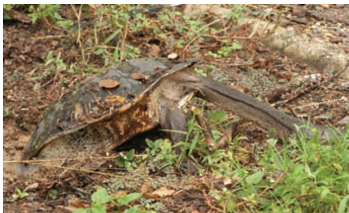
Figure 3. Front legs propping up the body to allow maximum hind foot reach during the final stage of nest construction in the broad-shelled river turtle C. expansa .

This process is similar in C. expansa and E. signata . Egg laying is relatively fast taking 10-20 minutes and eggs are laid one at a time. Typically one foot is left dangling in the nest hole during oviposition (Fig. 4), but after 2-4 eggs are laid this foot is withdrawn and the other foot is inserted and this process continues until egg laying is complete. Eggs can be moved by the hind foot coming into contact with them at this time and in some individuals a newly deposited egg is deliberately moved by the inserted foot before another egg is laid. Both species can be approached very closely once egg laying has begun without causing the female to abandon egg laying. C. expansa typically lays 10-22 eggs (mean clutch size 16) and E. signata typically lays 12-30 eggs (mean clutch size 18).