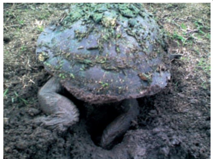
Figure 2. Nest construction in the broad-shelled river turtle Chelodina expansa . One hind foot at a time is inserted into the nest to scoop out the soil.