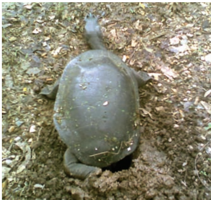
Figure 4. Egg laying in the broad-shelled river turtle C. expansa . Note that during egg laying one foot is typically left dangling into the nest.

Both C. expansa and E. signata use alternative movements of their back feet to 'sweep' soil back into the nest cavity once oviposition is complete (Fig. 5). The transition from oviposition to nest filling is typically rapid, nest filling commencing within a minute or two of the last egg being laid. Nest filling continues until the nest neck is filled to the original ground height. This process typically averages 12.2 \pm 1.0 min (range 10-20 min) in E. signata and significantly ( P < 0.001 ) longer 25.2 \pm 2.0 (range 20-30 min) in C. expansa . The longer period in C. expansa is caused by 'body slamming' behaviour in this species. After the soil has been back filled to the original ground level, C. expansa lifts the back end of its body off the ground with its hind legs, and then allows its hind legs to collapse