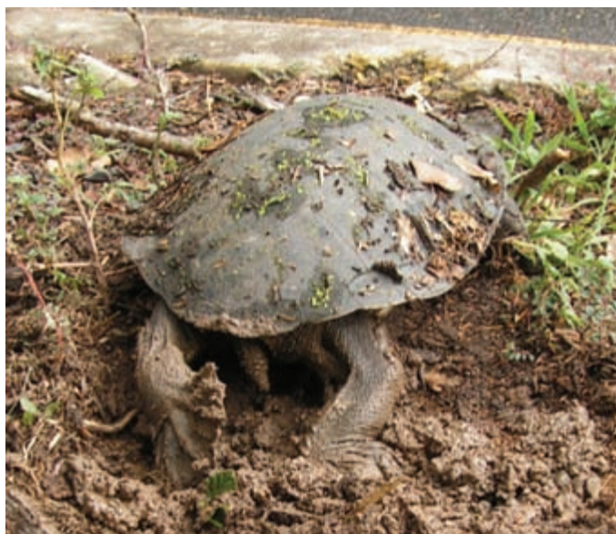
Figure 5. Back-filling of nest using hind feet to sweep soil into nest hole by C. expansa .