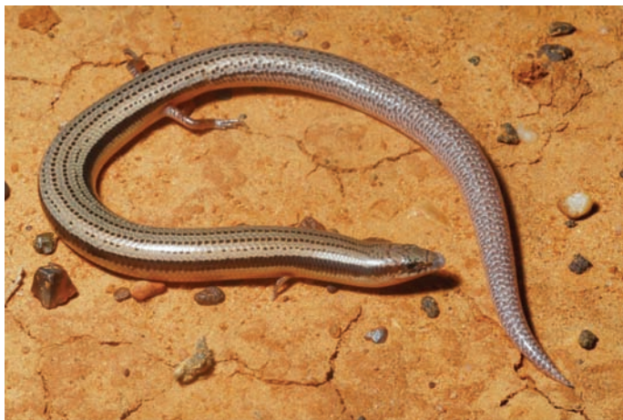
Figure 2. Lerista desertorum (J85444) collected from Toko Range, SW Qld.

A single Lerista desertorum was collected and lodged with the Queensland Museum (J85444; Figure 2) from open Acacia cyperophylla and A. aneura tall shrubland on a low stony plateau within Cravens Peak (23°7'12"S; 138°19'55"E, Figure 3). The plateau is part of the Toko Range. J85444 conforms to the original description of Lerista desertorum (as Lygosoma planiventrale desertorum ) (Sternfeld 1919) and to accounts of L. desertorum presented in Storr (1971, 1991), Cogger (2000) and Wilson and Swan (2008). Specific morphological and