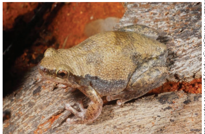
Figure 7. Litoria electrica (J85385) male, Cottonbush Creek, west of Boulia, SW Qld.

Both individuals closely conformed to the description of L. electrica (Ingram and Corben 1990). Among other features, the description separates L. electrica from L. rubella on the basis of banded dorsal surface, which often includes "an indistinct chocolate mark across the upper back; a chocolate forward-pointing chevron across the lower back" (from description of the holotype). The call of L. electrica is also distinct, being higher pitched than that of L. rubella . The authors have had previous experience with both L. electrica and L. rubella and immediately recognised its distinctive call in the field prior to collecting J85385.