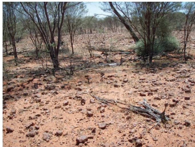
Figure 3. Lerista desertorum collection locality. Cravens Peak, SW Qld.

pattern features of J85444 include large size (SVL 75 mm; tail length 78 mm), mid-body scales in 20 rows, moveable eyelids, 2 fingers, 3 toes, nasal scales moderately separated (rostral in narrow contact with frontonasal), prefrontals widely separated (frontonasal in broad contact with frontal), frontoparietals paired and narrowly separated and about the same width as the interparietal, two nuchal scales, no ventrolateral keel present, temporals 1 + 2 (i.e. one primary and two secondary temporals sensu Horner 2007), dorsal surface silver-brown with two paravertebral rows of dark brown squarish spots, each spot about 1/4 – 1/3 scale width, two additional broken rows of dark brown laterodorsal spots present, each spot 1/6 – 1/4 scale width, dark upper lateral stripe approximately 1.5 scales wide.