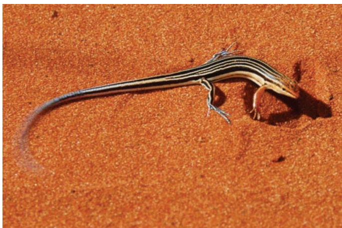
Figure 5. Ctenotus calurus scratching for termites using circular motion of forelimbs. Note rapidly shaking tail.