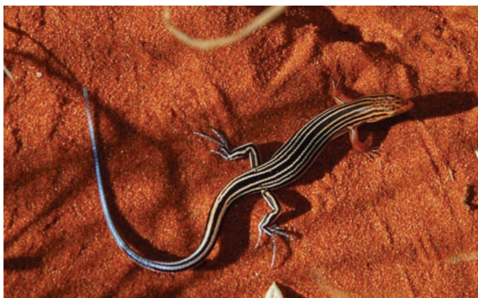
Figure 4. Ctenotus calurus scratching for termites, Cravens Peak, SW Qld. Note numerous scratch marks on the ground, and caved in surface sand where the skink was catching termites underground.

Pianka (1969) reported unique feeding behaviour (among desert Ctenotus ) in C. calurus , involving continual movement, lashing of the blue tail and occasional pauses to dig up insect larva. Further details of feeding behaviour are presented here. Ctenotus calurus was observed feeding on termites on one of our standardised sites commencing at 4:20 PM on 06/04/2007. The skink fed by apparently looking and listening intently at a point in the sand. It would move around with jerky movements and then suddenly plunge head first into the sand, penetrating the very thin (1 – 3 mm) surface crust (visible in Figure 4) and leaving everything behind the midbody exposed above the surface. Whilst so buried, it would scratch with hind, and possibly forelimbs, causing sand to collapse in around its body. This would dislodge termites from underneath the soil surface. It would then emerge, sometimes with a termite in its mouth, but often not. It would then quickly eat any termites exposed on the ground by its digging action. It would also dig with forelimbs in a circular motion (Figure 5) and hindlimbs, but with its head above ground after looking/listening at the sand surface. It would dislodge many termites in this way and rapidly consume them. All actions were frequently accompanied by twitching and shaking of the obvious blue tail (Figures 3 & 4).