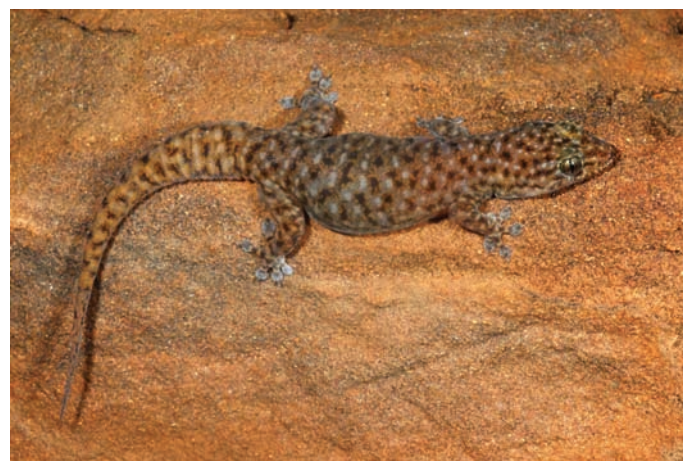
Figure 6. Gehyra nana , Toko Range, Cravens Peak, SW Qld.

Gehyra montium is poorly differentiated from G. nana , e.g. Cogger (2000) differentiates the species on the basis of dorsal colouration (reddish- or orange-brown in G. montium vs pinkish-grey in G. nana ). In Storr’s original descriptions of these two species (Storr 1978, 1982), no morphological characters for separating them are provided; indeed in the descriptive paper of the