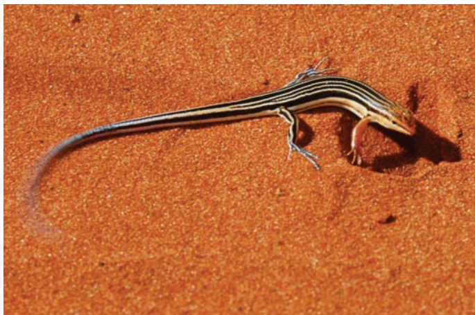
Figure 5. Ctenotus calurus scratching for termites using circular motion of forelimbs. Note rapidly shaking tail.