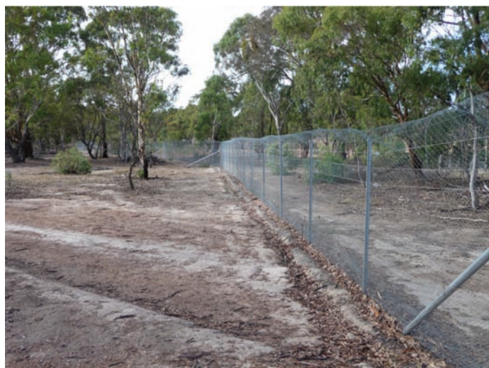
Figure 2 – The feral animal exclusion fence in Mulligans Flat Nature Reserve.

structure), which occur at either the polygon level or the site level. Within each site, two points or 'plots' have been established (Figure 3). The experiment provides a wide inductive basis for general inferences relating to Yellow Box-Blakely's Red Gum Grassy Woodland management regionally. The statistical framework also lends itself to additional studies on aspects of woodland and restoration management. Hence, the experiment's potential as a long term ecological research site and outdoor laboratory.