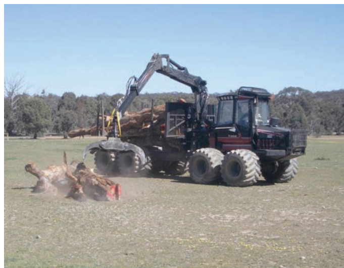
Figure 4 – Placement of logs on an experimental site with forestry forwarder.

Fire is a key form of disturbance in temperate woodlands (Hobbs 2002; Prober et al. 2004). However, its effects are complex, and vary with the woodland system in question, the components of fire regimes ( sensu Gill et al. 1981) and other factors. Fires can assist nutrient recycling, promote regeneration of some plant species, reduce the dominance of others such as dense thatches of Themeda australis (allowing other plants to grow), and contribute to the maintenance