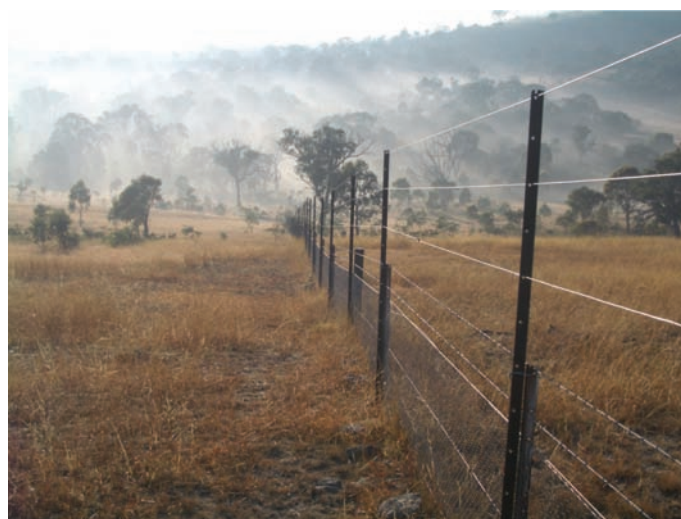
Figure 5 - A kangaroo exclusion fence in Goorooyaroo Nature Reserve.